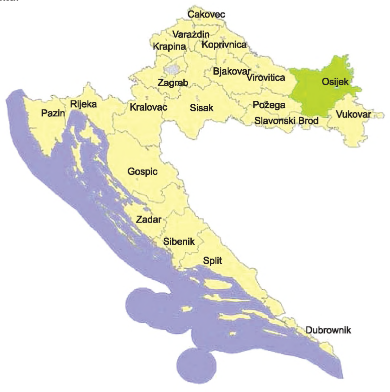
Fig. 1. Position of Osijek-Baranja County in the Republic of Croatia

Osijek-Baranja County is the fourth largest Croatian county by area, with total area of 4 152 km<sup>2</sup>. Figure 1 shows position of Osijek-Baranja County in the Republic of Croatia.