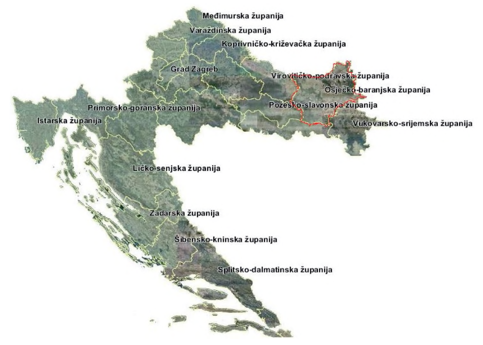
Fig. 3. Map of Osijek-Baranja County – project area

As shown by Figure 3 we used digital orthophoto map (DOP5) from Geoportal of State Geodetic Administration to describe the area of the project which is Osijek Baranja County<sup>5</sup> situated on eastern Croatia.