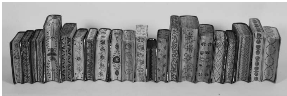
Fig. 1. The bindings from Metsiku collection.

In 1966, while searching for antiquarian books in Lääne-Viru County, the acquisition librarians of the F.R. Kreutzwald State Library of the Estonian SSR came upon a large library in a farm in Villandi village, acquired during several generations. The owners agreed to sell the whole collection (Pärloja, 1969). In addition to books, the purchased collection contained photo albums, documents, and manuscripts by the family members – diaries, literary experiments, folk stories, and handwritten speeches, etc. In total, 2365 items of publications and manuscripts were registered as a memorial collection, conventionally named the Metsiku collection, within the Archival Collection in the year of 1971 (Tamme, 1973).