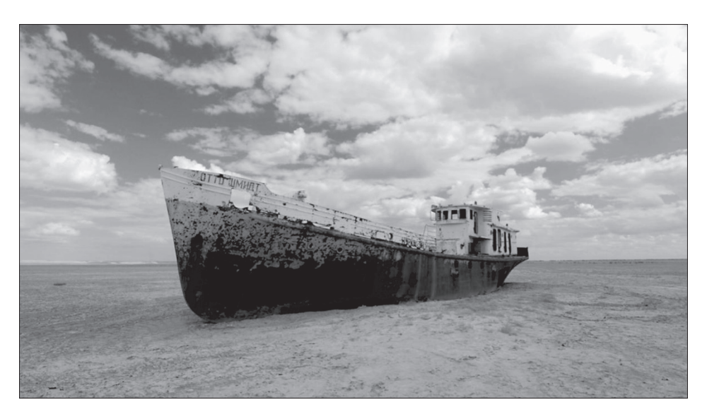
Photo 1. A desert-bound maritime vessel on the former Aral Sea bottom near Ak Basty, Kazakhstan

A single image, made by the author on the former seabed of the Northern Aral Sea near Ak Basty, Kazakhstan in September of 2011 (Photo 1) will serve as a vehicle through which the geographical framing will be guided.