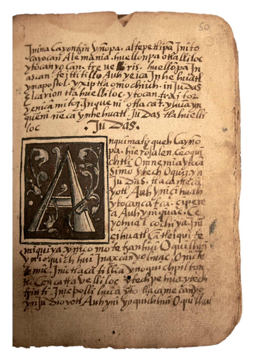
Figure 2. A Judas story, John Carter Brown Library Codex Indianorum 7, fol. 51r.