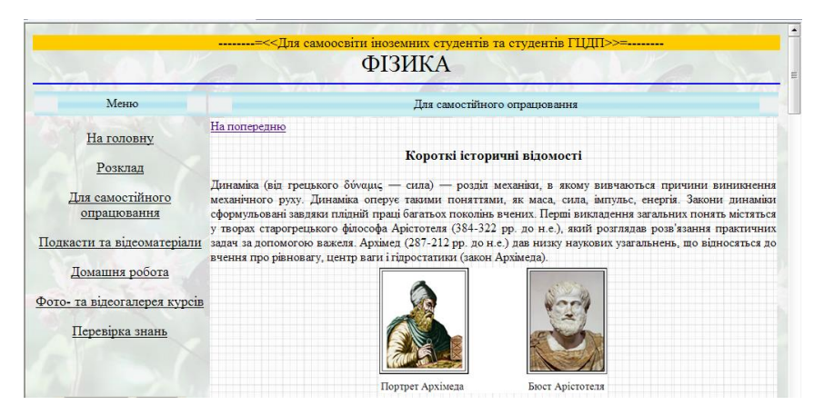
Pic. 2. The menu item "for self-testing"

The menu item "for self-testing" (Pic. 2) consists of four sub-paragraphs (the basis of kinematics, the basis of dynamics, conservation laws in mechanics, fluid mechanics), each containing problems, historical information, theoretical material, word puzzles, crosswords, chaynvordy, quiz questions (with answers), poems and prose. Suggested tasks allow students to independently verify their knowledge, identify confusing points, gaps in knowledge and then consider the solution of the problem by using a hyperlink.