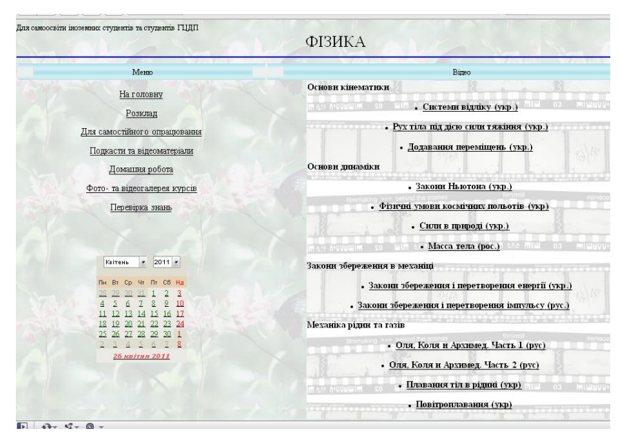
Pic. 3. The item "Podcasts and video". The list of available videos