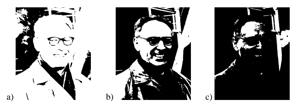
Fig. 3. Simple thresholding with THRESH_BINARY: a) threshold = 50, b) threshold = 127, c) threshold = 170

In the definition of function responsible for handling view in Django, additional parameters should be declared. Results of applying different values of threshold for binary type (THRESH_BINARY) of thresholding are presented on figure 3. In this example additional parameter is just a fixed-value of threshold (OpenCV, 2017).