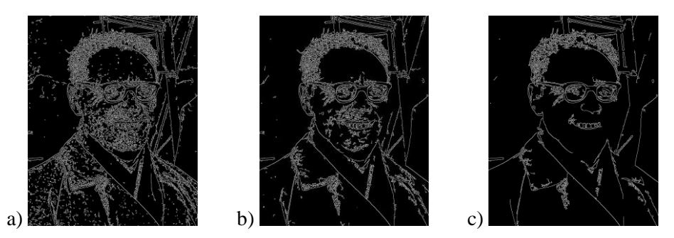
Fig. 6. Canny's edge detection with different values of thresholds: a) lower = 50, upper = 100; b) lower = 50, upper = 150; c) lower = 50, upper = 250

In OpenCV one of the algorithms that requires two parameters is Canny's edge detection algorithm. Aforementioned parameters are upper and lower threshold for the hysteresis procedure (Canny, 1986; OpenCV, 2017). Results of applying Canny's algorithm through Web-based API are presented on figure 6. It is worth mentioning that Canny recommended an upper/lower ratio between 2:1 and 3:1 (Canny, 1986).