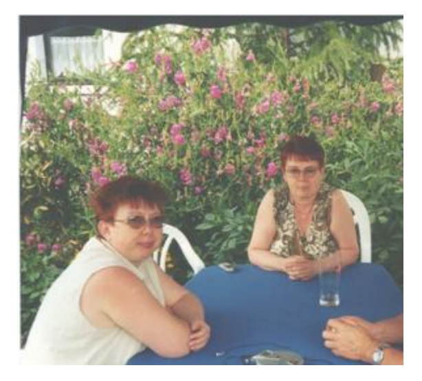
Photo 3. The photo entrusted by a patient

Similarities may refer to people, situations or the emotional climate of the photographs. Let us consider several examples. Photo 3 presents two women who are strikingly similar. The story accompanying this photograph reveals that they are a mother and an adult daughter. They are not only very similar in terms of physical appearance, but also generation differences between them are blurred (the same colour of dyed hair, similar clothes, dark glasses, etc.), which may be significant in script analysis. The woman in the background is the mother (aged 59) and the woman in the foreground is the daughter (aged 40).