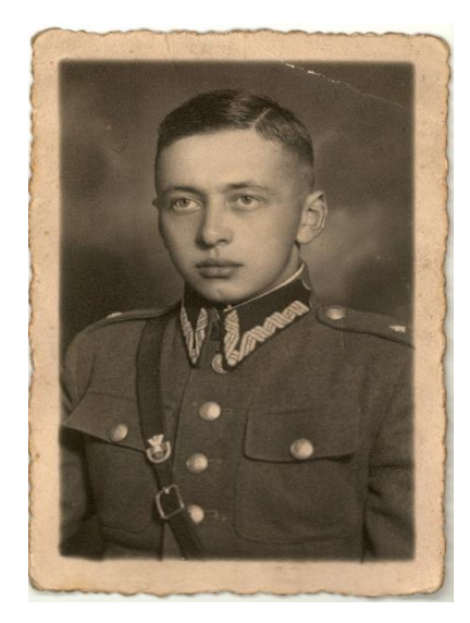
Photo 10. The photo of a soldier

Photographs sometimes hide a kind of a script secret, which can be solved only after many years. Photograph 10 was taken in 1948 in Poland. A young soldier fell in love with a slightly older girl and gave her his photograph. Then, their lives went along two separate paths. An elderly owner of the photographs claims that it has always had and still has a great influence on her life. She often looks at it and thinks of the boy who has not become her husband. In difficult moments of her life she looks at the photograph and goes back to the moment when she was loved by someone. Overleaf (Photo 11) a young soldier drew a heart and said that it contained a coded important message. The woman has not been able to decipher this intriguing message. After listening to the story, the therapist, to his amazement, solved the puzzle and read (it was enough to look at it from a certain angle): 'I remember and I love you'.