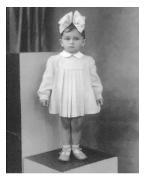
Photo 9. A photograph selected by the patient

The variation in which we have only one photograph from early childhood evokes comparisons between now and the moment in which it was taken as well as between the patients' current situation and their early life determinants. It is a look from the perspective of accumulated present experiences and memories from one's distant past. In a special way this moment identifies one's life script: an unconscious life plan based on early childhood decisions and illusions. It is not possible to unambiguously determine whether a person remains under the influence of script at present, although there are two factors which can be helpful: if the patients perceive their current situation as stressful, and if there are similarities between their current situation and stressful situations from their childhood.