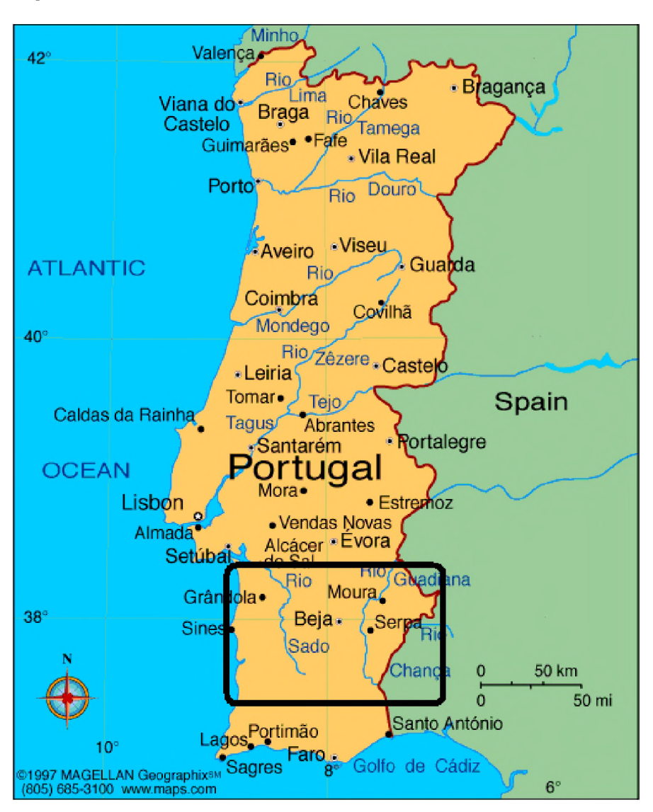
Figure 2. The territory under the direct influence of the IPBeja

The Polytechnic Institute of Beja (IPBeja) is located in Beja, the capital of Baixo Alentejo region and has as direct influence in the geographical areas called Baixo Alentejo and Alentejo Litoral. The IPBeja is the only public HEI in the region.