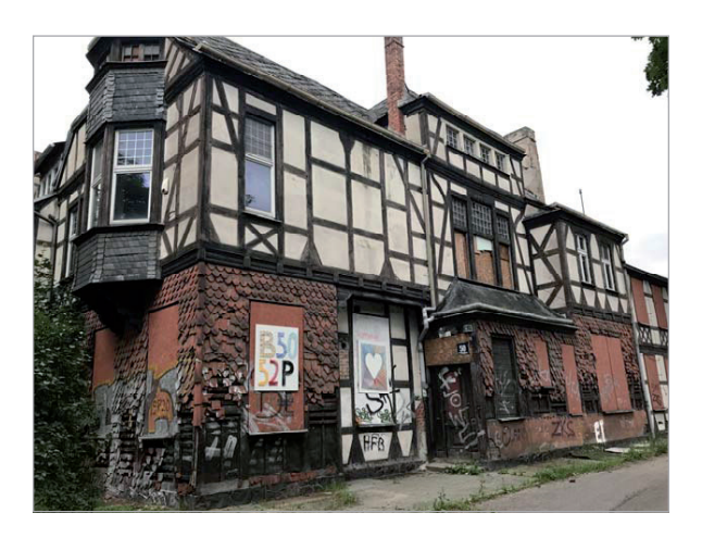
The building at Bydgoska 50 - the picture taken in May

Apart from lighting, what contributes to the sense of insecurity is devastated environment, derelict tenant houses or the visible signs of vandalism. Devastated space fits the theory of broken windows. Conspicuous lack of responsibility for certain buildings, at least on the part of a private owner and also on the part of self-government makes a given house, fence or a small architecture get damaged by vandals. In the area of the scrutinized district, these places are located in the streets indicated by the inhabitants in the survey. At Bydgoska 50, there is a historical building getting damaged. Despite the attempts to endow the place with a new useful character, after the eviction of the inhabitants, the building got clearly degraded month by month. Such buildings are plentiful in the area of the district.