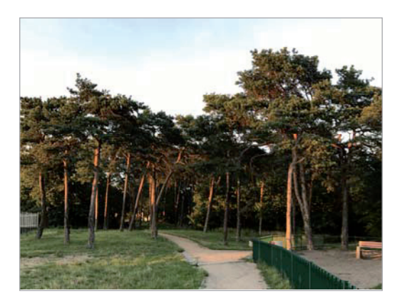
The fragment of "Piekarskie Góry" - at 19:00 in June