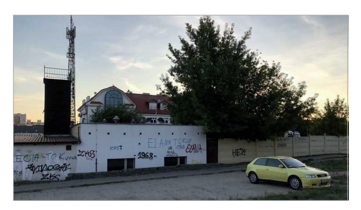
A passage towards "Piekarskie Góry"

It is hard to imagine that the avenues in the parks were illuminated as well as promenades in city centres; however, the lack of lighting coupled with the absence of a police station contributes to the fact that the parks located in Bydgoskie Przedmieście are judged by its inhabitants as dangerous, especially during autumn and winter. The question arises: is it worthwhile to endow the neighbourhood without a police station with one such station? What follows from the research is that 67% of the respondents are in favour of setting up a police station there – 36% of the respondents emphasized their frank acknowledgement by choosing the answer 'definitely yes' and 31% of them answered 'yes', In the inhabitants' opinion, there is a need for a police station – among others – in the cases calling for quick intervention and when it comes to the general order in the streets. However, 30% of the respondents believe that a police station is not needed and