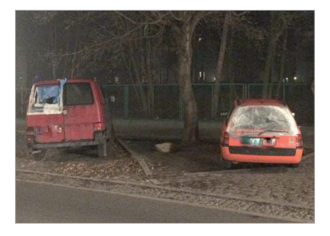
Cars parked on Mickiewicza Street - March

the environment and hence to the decreased sense of security on the part of the inhabitants.