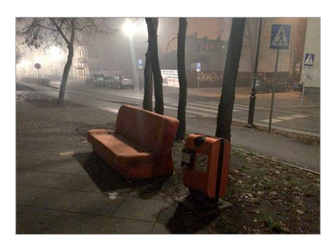
Mickiewicza Street - March

The pictures show that the main street of the district, Mickiewicza, due to a few processes taking place in its area (as far as it's public sphere), may have a negative impact on the sense of security of its inhabitants.