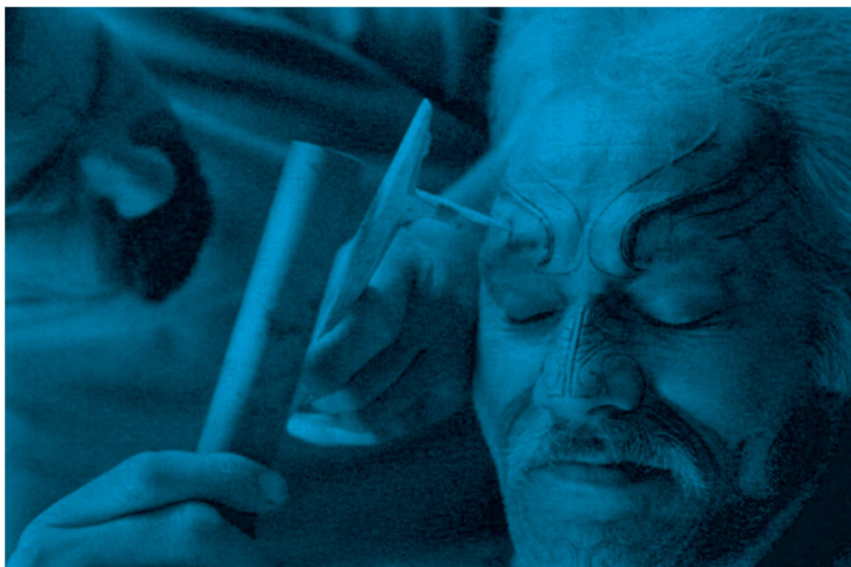
Pic. 4. Traditional tattoo making

was also connected with the transition phase. The tattoo ceremony was taboo.