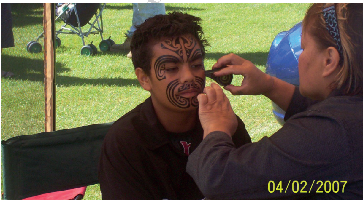
Pic. 6. Youth cultivating the Moko tradition, temporary facial painting