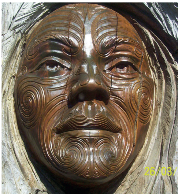
Pic. 5. Characteristic patterns (Sculpture in Abel Tasman, South Island) (Author private collection)

currently, are instances of entities of the same kind existing in the past. This relation is the essence of inheritance for Maori. This means the relation between an ancestor and descendant. For Maori the whole universe is a gigantic family originating from the same ancestor.