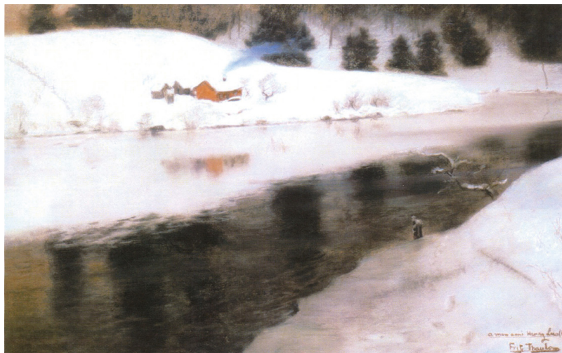
Example 2. Frits Thaulow, La Rivière Simoa en hiver . 21

The painting ( La Rivière Simoa en hiver , see Example 2), despite a large area of white, shows dark and gloomy atmosphere, reinforced with the shadow of the trees reflected in the water.