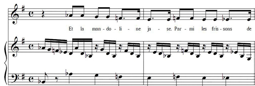
Ex. 1b: G. Fauré, Mandoline , bb. 27–28. Musical illustration of the words “Et la mandoline jase” (“mandoline moan”).

In terms of using the text, compositions emphasize however the different attitude of artists towards literary prototype. Fauré is much less restrictive, he repeats the first verse of the poem in the ending of Mandoline (bb. 30–38), creating the construction of arch features (scheme ABA'), that is not implied by the Verlaine's poem. The composer arrange the text also in the melismatic way (e.g. in b. 3 on the syllable “sé-” in the word “sérénades”, in b. 8 on the syllable “-mu-” in the word “ramures”), introducing in bars 9–10 and 17–18 the full of grace phrases of the Spanish timbre, based on the hexachord f\#-g\#-a\#-b-c\#-d\# . 16 Another difference is situated in the character of a vocal part: in Fauré's song full of lyricism, especially in episodes A and A' (small intervals, articulation legato , expression remark