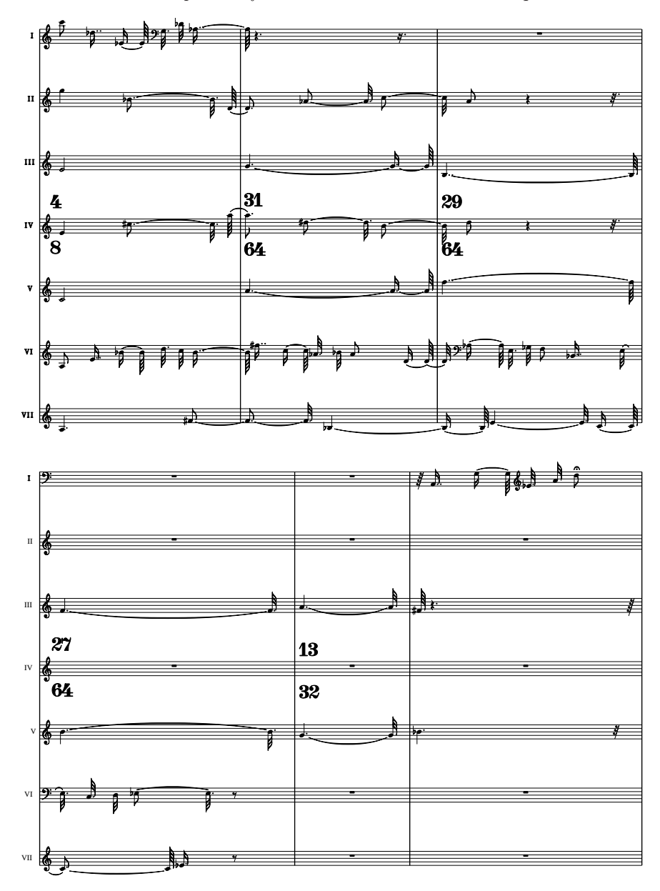
{\bf Fig.~7.4.~Antoni~Prosnak,~\it Composition~\it with~a~\it Universal~\it Series.}