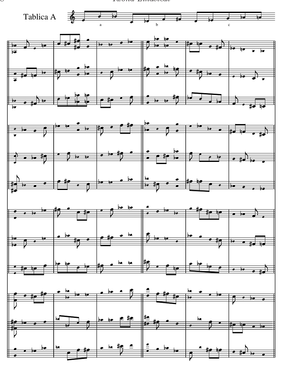
Fig. 7.5. Zygmunt Mycielski, twelve-note matrix with highlighted groups.