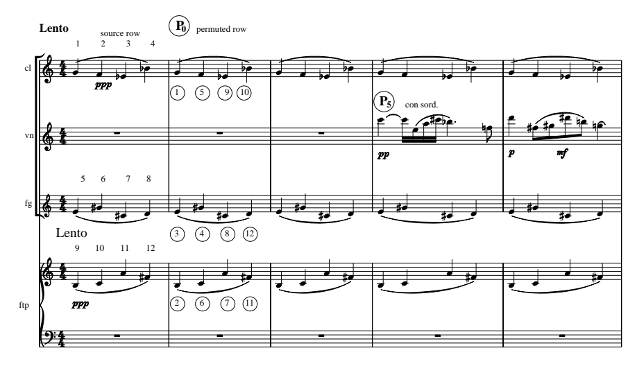
Fig. 7.3. Konstanty Regamey, Quintet for clarinet, bassoon, violin, cello and piano, mov. II., b. 1–5.

idea of "variation through repetition", which in the composer's later works led to a totally new form — the mobile. On the other hand, Bogusław Schaeffer's Two Piano Compositions (1949–1950) and the piano Composition (1954) express fascination with the interval as the main carrier of the melic content in music. For Schaeffer, the adoption of the rules of dodecaphony was from the beginning linked with attempts to go beyond Schönberg's classical model towards serializing musical parameters other than pitch.