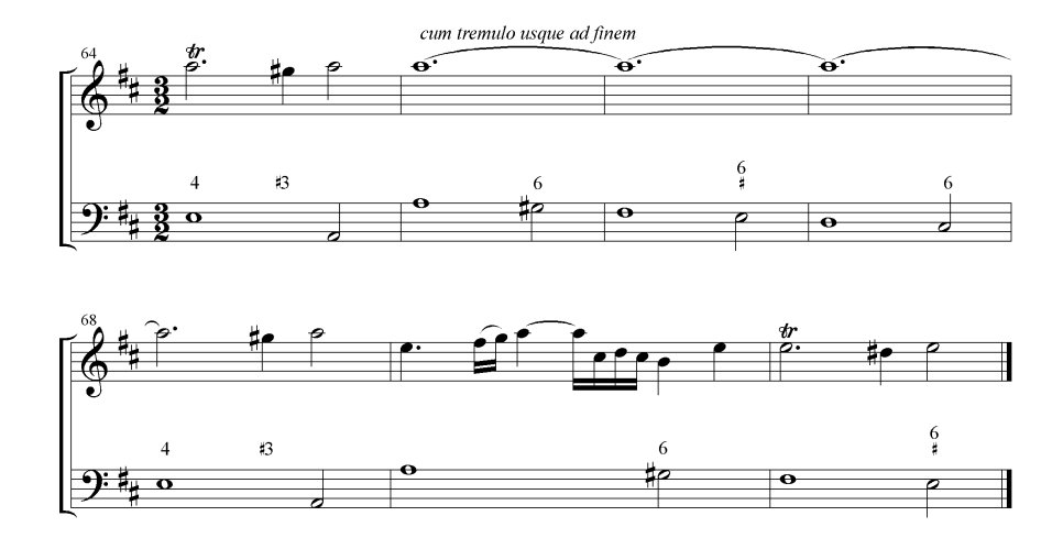
Fig. 1.5. Trill, tremolo: Sonata I, bars 64–70.