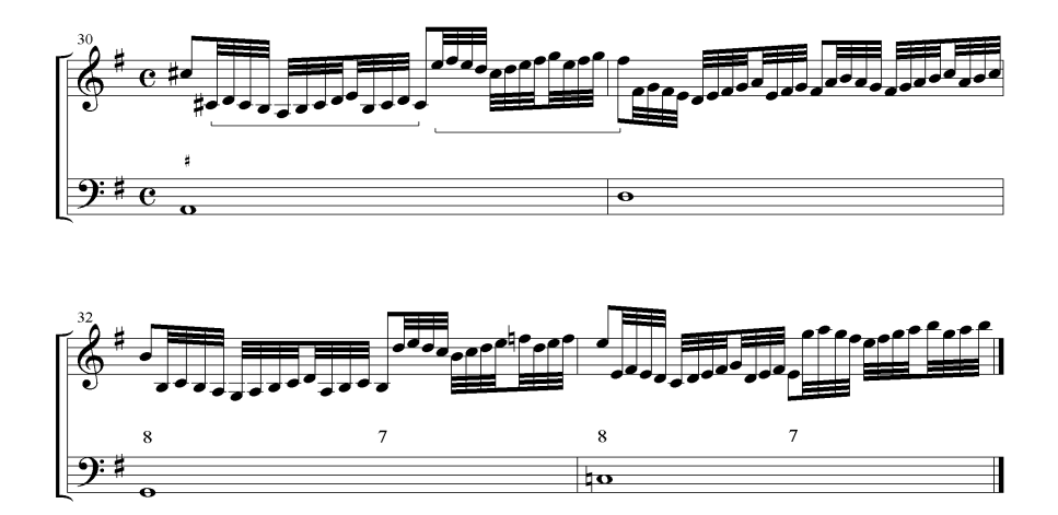
Fig. 1.7. Two-plane phrases: Sonata II, bars 30–33.