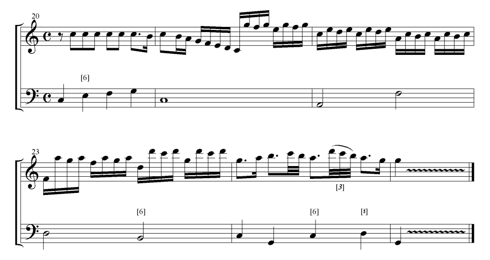
Fig. 1.4. Sixteen configurations based on quadruple groups: Sonata IV, bars 20-24.