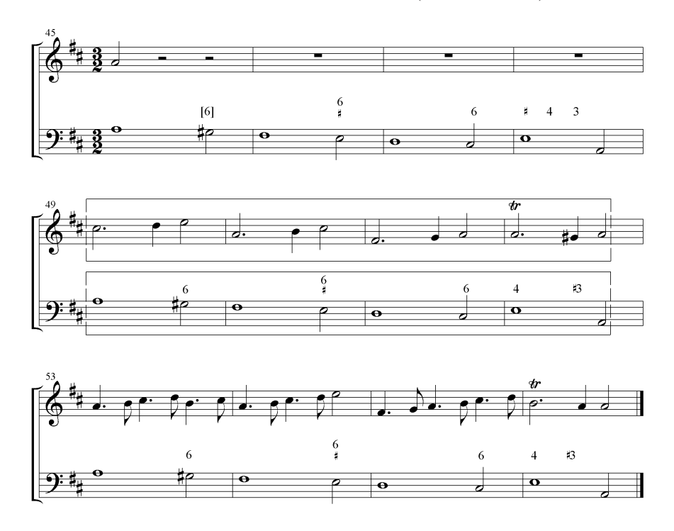
Fig. 1.1. Sonata I, bars 45–56.

An interesting, although characteristic for the period, formal device employed by Döbel in the first two sonatas was to base the triple measure part on ostinato schemas. In the first sonata the ostinato formula, which fills an octave, with a descending melodic line closed by a cadence deviation, is repeated 22 times in the bass part. The violin part which develops against this background is a variation treatment of the theme, which in its basic version consists of four sequentially juxtaposed motifs (see figure 1.1).