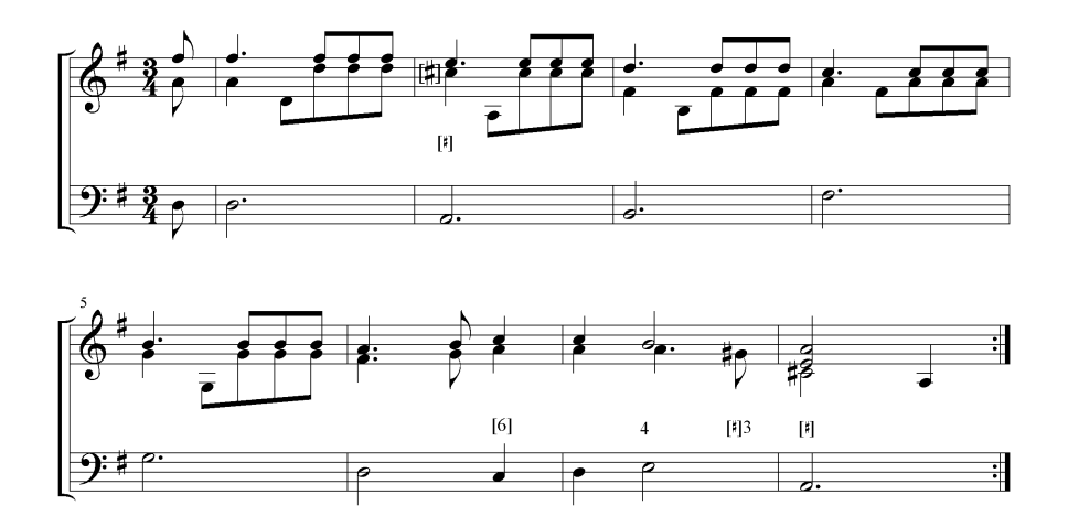
Fig. 1.3. Playing multiple notes: b) Couranto, bars. 1–8.