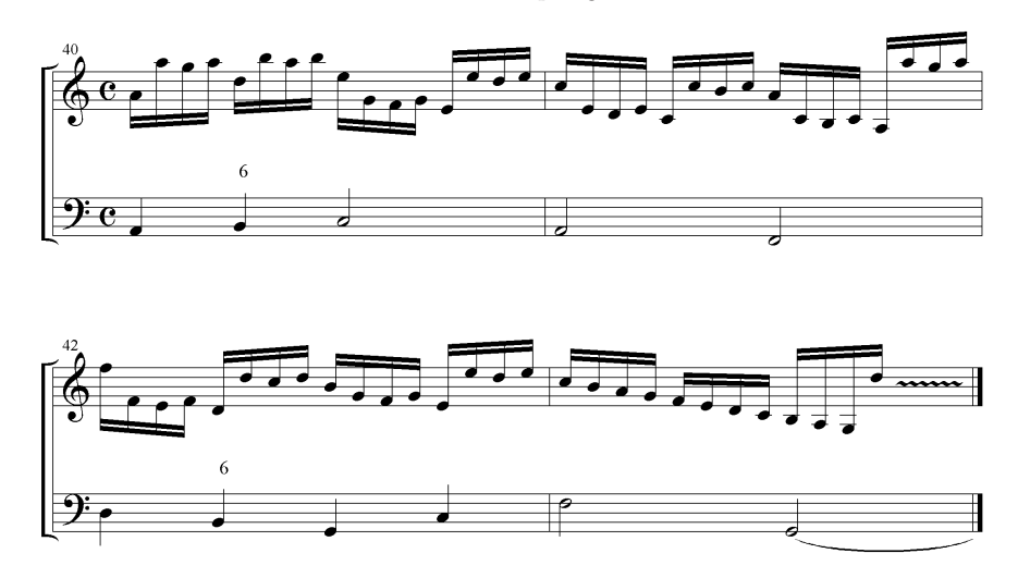
Fig. 1.6. Fast jumping over the strings: Sonata IV, bars 40–43.