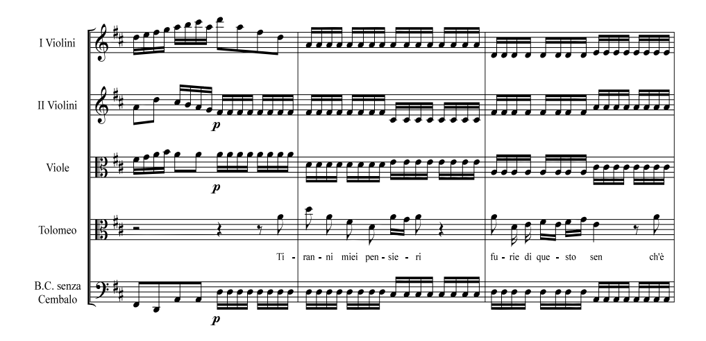
Figure 3.2 Tolomeo's aria 'Tiranni miei pensieri', bars 5-7

We should now turn to the comparison with the aria 'Tiranni miei pensieri' from Tolomeo et Alessandro . Its first three lines are a Presto passage. The syllabic musical setting of the words and the forceful driving rhythms illustrate the tyrannical thoughts plaguing the hero (bars 5–7, see Figure 3.2).