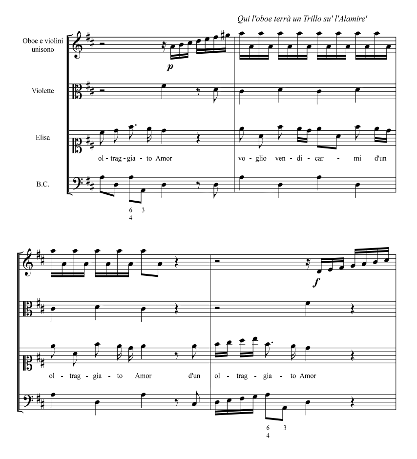
Figure 3.1 Elisa's aria 'Io voglio vendicarmi', bars 20-23

while the vocal line consists of a repeated motif involving interval leaps to depict Elisa's anger and hurt pride.