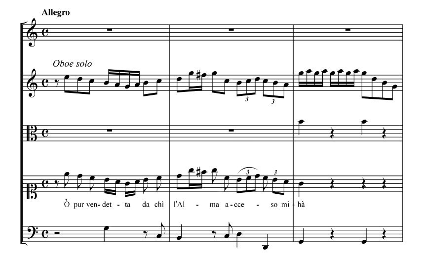
Figure 3.6 Elisa's aria 'Voglio amore, ò pur vendetta', bars 17-19

exploited and polished those elements which were universally admired by Roman aristocracy. Capece and Scarlatti were better at this than most, as can be seen from the following passage taken from Foglio di Foligno , one of the 18th-century printed dispatches, dated 24 January 1711: 'Questa Regina di Polonia ha dato principio ad un'Opera Pastorale, che fa Rappresentare in Musica nel suo Teatro Domestico riportando il vanto sopra tutte l'altre che si recitano negl'altri Teatri.<sup>35</sup>