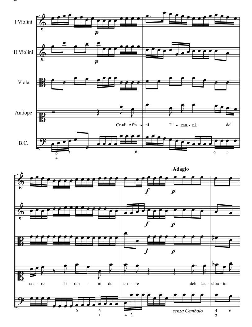
Figure 3.4 Antiope's aria 'Crudi affanni', bars 4-8

When the words 'ò pur vendetta' are reached, the flute falls silent, and a solo passage of the oboe with unison voice is brought to the fore (see bars 17–19, Figure 3.6).