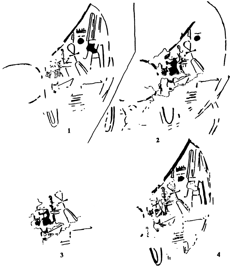
Fig. 2. Bark room of the Amun sanctuary, southern wall: successive stages of the decoration of the Amun bark. The kneeling king offering mat to a seated Amun-Re is clear on the last study. Drawing K. Spence.