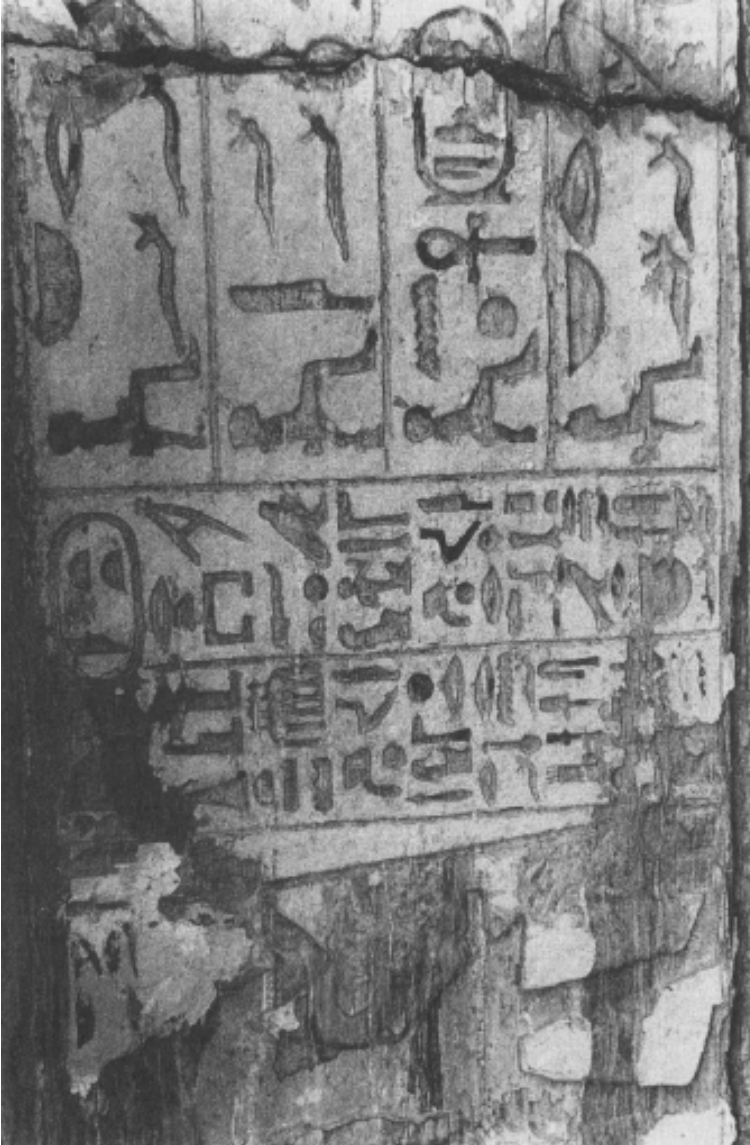
Fig. 3. Names of the deceased in the inscription on the lintel. Tomb of Meref-nebef (Sixth Dynasty), Saqqara.