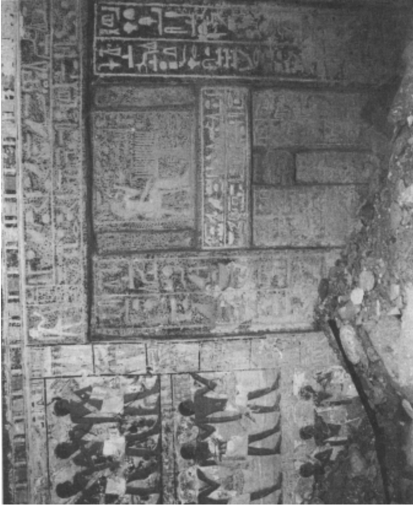
Fig. 4. "False door" in the tomb of Meref-nebef at the moment of discovery.