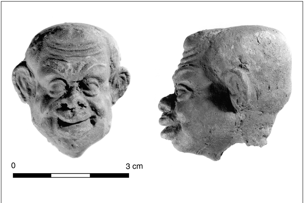
Fig. 2. Head of a dwarf (front and side view), TA 99/57

The stratigraphy revealed in the two other cellars turned out to be very strange indeed. Room 269, recorded at the depth of 1.35 m below the top of a Middle Ptolemaic wall, was well dated by coins of Ptolemy II and corresponded to an early 3rd century BC level. The other cellar, room 270, found at the same depth (1.40 m), yielded a large deposit of fragmentary terracotta figurines, which were dated by a coin of Ptolemy V to the beginning of the 2nd century BC.