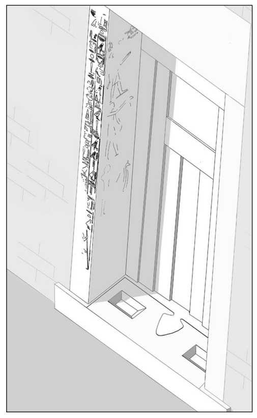
Fig. 2. Reconstruction of the offering place in Chapel 10, showing the position of jamb S/01/20 (Drawing K. Kuraszkiewicz)

The text can now be reconstructed as follows:<sup>7)</sup>