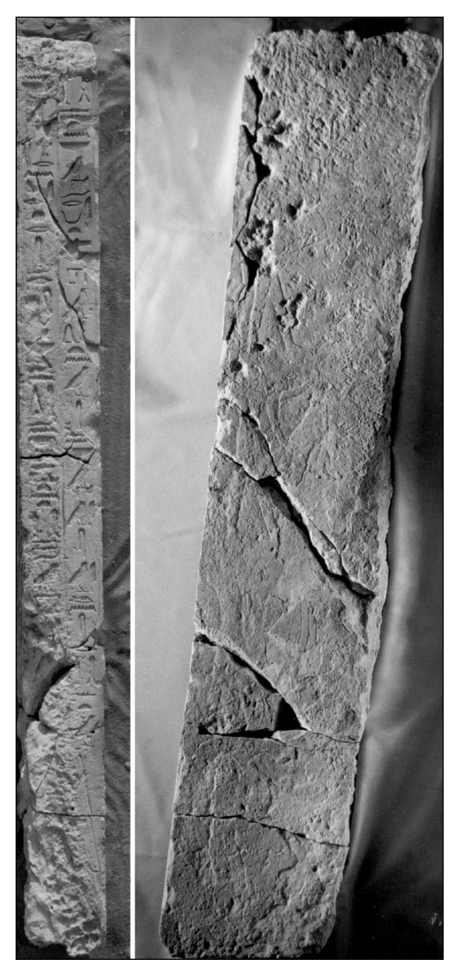
Fig. 1a. The frontal and lateral side of the jamb with recently found elements fixed in place

These observations make the composition of the text quite clear. The preserved part of the self-laudatory text consisted of three parts: an epithet, followed by two autobiographical sentences and a title, which most probably preceded the name of the deceased. Although it may not be excluded that the text began on the lintel, this eventuality seems less probable, as lintels usually received separate decoration. <sup>6)</sup>