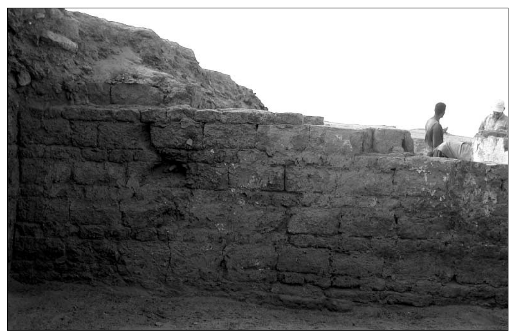
Fig. 3. Examples of different bondwork from the excavations on Kom A in Naqlun