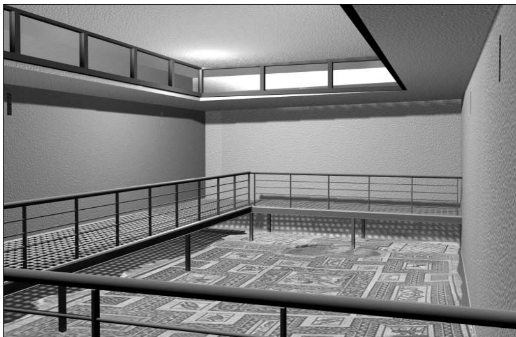
Fig. 1. The interior of the mosaic shelter in computer rendering, facing north (top) and south (Rendering D. Tarara)