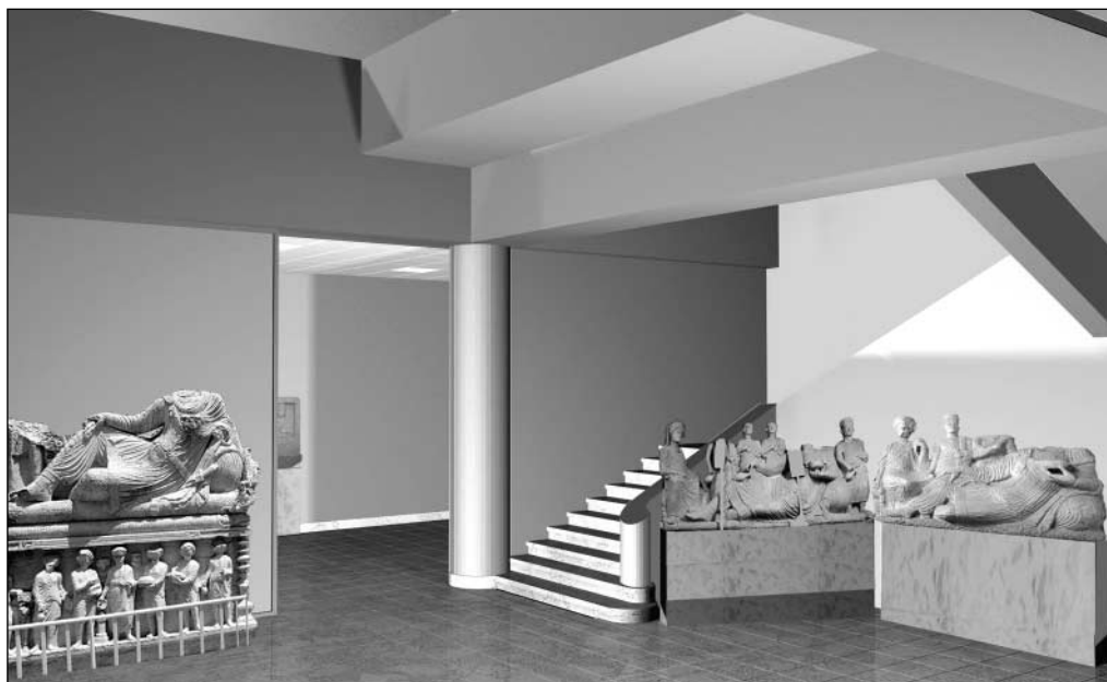
Fig. 3. Refurbished Museum entrance hall. To the right, sarcophagi from the 'Alaine tomb (Rendering D. Tarara)