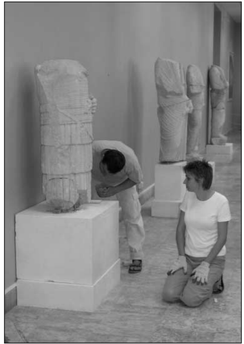
Fig. 2. Restoration work on the archaic statues in the gallery of Allat

Another of the season's tasks was to design a shelter to be erected over the mosaic discovered in 2002-2003. 4 Consultations with colleagues at the DGAM led to the decision to exhibit this nearly complete