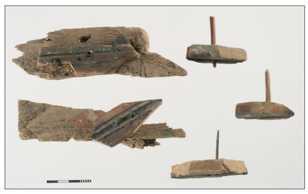
Fig. 3. Examples of mounting of the altar screen elements