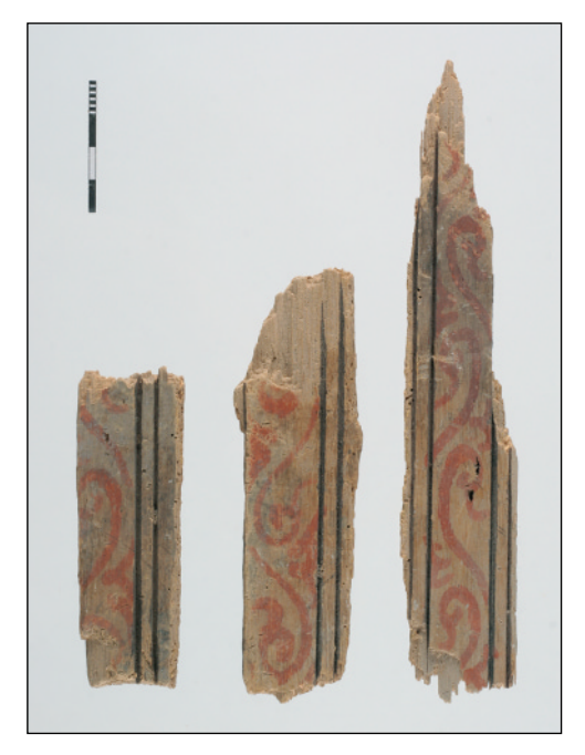
Fig. 4. Slats with painted floral scrolling

Another element of the higab decoration are the 17 pieces of slats forming the structural frame. Some of these slats have the back cut at right angles, perhaps for the purpose of joining elements. The hexagons and slats feature the same uniform decoration consisting of three grooved lines between painted stripes by the edges. The colors in this case are