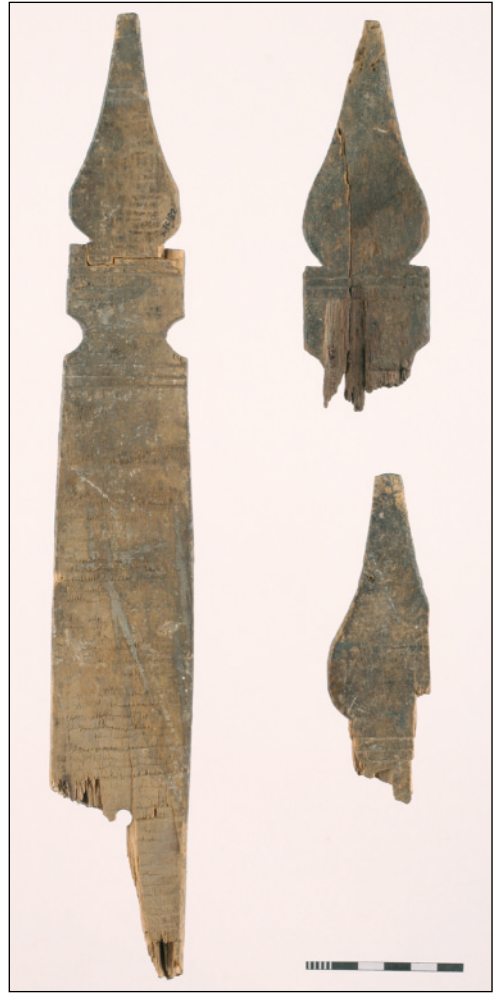
Fig. 5. Leaf-shaped wooden finial

Despite the fact that three fragments of the background have been preserved, the pattern of the decoration is difficult to determine. In different places it is possible to observe sets of two holes each: round for the wooden peg and square for the iron nail. Irregular paint stains (green and red) can also be seen, suggesting that particular