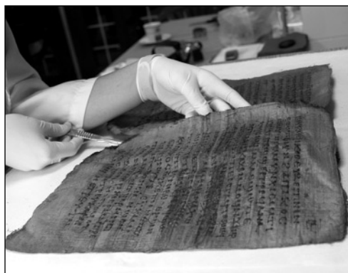
Fig. 7. Separating the papyrus book quires