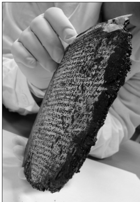
Fig. 1. Parchment block after detaching from wooden board

was prepared to moisten and straighten each card, following a standard procedure of moistening from a distance, which was determined to be appropriate and effective in this case. The objective was to relax parchment fibers and thus straighten the deformed and folded card surfaces [Fig. 3]. Upon removing from the chamber, each card was immediately cleaned of the remains of sticky melted parchment. The moistened card was placed on a thin acidless cardboard, delicately stretched with Filmoplast P and left to dry freely.