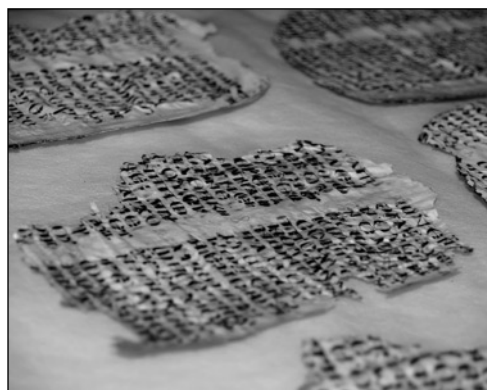
Fig. 3. Separated parchment cards during the moistening process