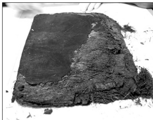
Fig. 4. Papyrus book with stamped leather cover ( Canons of Pseudo-Basil ) before conservation

now in air-conditioned storage in the Museum, closed in a metal chest between disinfecting layers introduced for prophylactic purposes.