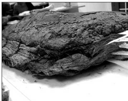
Fig. 6. Papyrus book in stamped leather cover ( Enkomion of St Pisenbrius ) during conservation