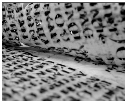
Fig. 2. Parchment block during separation of particular cards