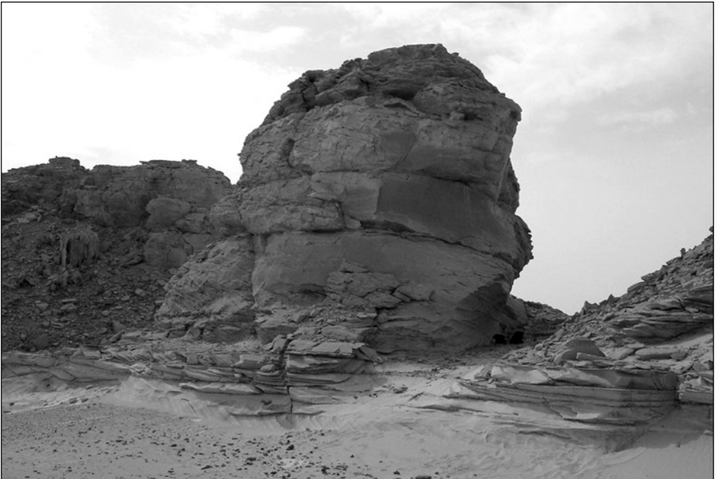
Fig. 4. The middle one of three hills on Site 4/05 with the petroglyph panel in the center