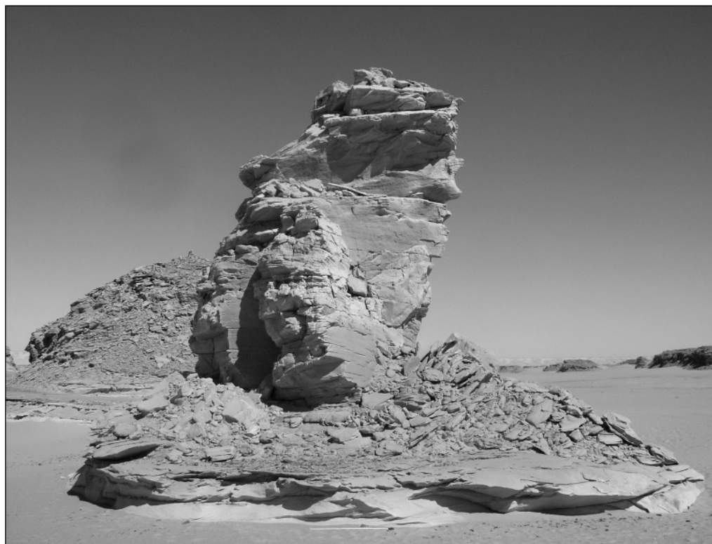
Fig. 1. Site 2/05 in the "Painted Wadi" in Dakhle Oasis – rocky outcrop with vertical "drawing board", view from the south

At top left there is a schematic representation of one of the “ladies of the oasis” with a strange heart-shaped head and below her two more ladies, standing with their backs turned to the fourth, depicted merely as a stick-like human figure [Fig. 2]. The right side of the panel is filled with animals. A creature shown more or less on the same level with the “ladies” is a quadruped, maybe a giraffe, its legs formed like four vertical incisions in the rock. A careful look reveals the back end of an animal with raised tail, made by rubbing. It looks as if one animal was smoothly incorporated into the other.