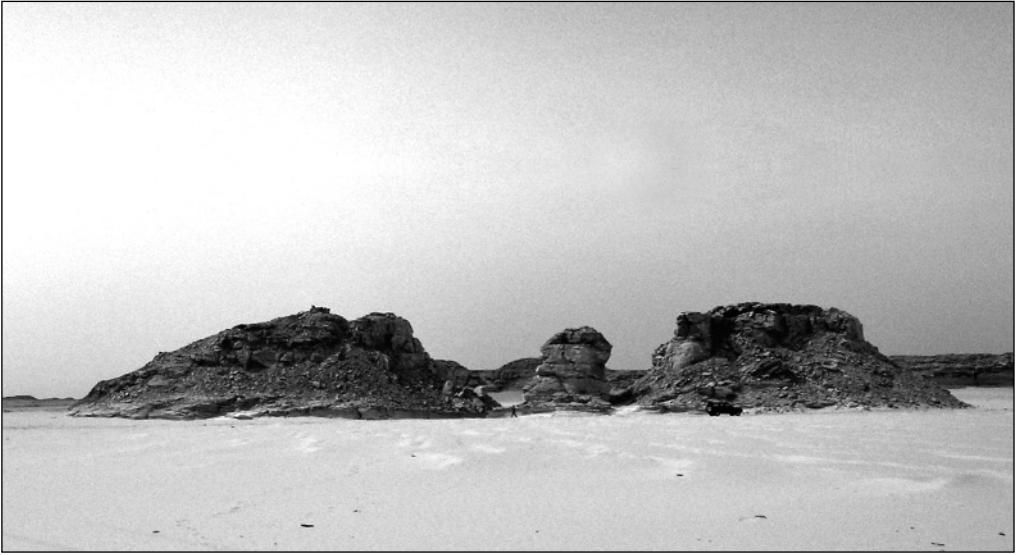
Fig. 3. Site 4/05 in the “Painted Wadi” in Dakhleh Oasis