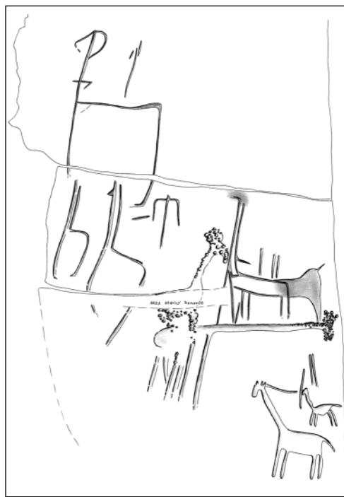
Fig. 2. Tracing of petroglyphs from Site 2/05 (E. Jaroni, E. Kuciewicz)

Indeed they appear to share the trunk, but not the legs, since an additional pair of legs observed in front could belong to the animal at back. The neck of the animal is incised, like the legs, but the head seems to belong to the animal at back for it is rubbed. The meaning of this is unknown. Below again two giraffes, one pecked and the other partly pecked and partly incised, both slightly bent, perhaps because of insufficient available space. Even the muzzle of the pecked one is turned down, so as not to cover up the other image. This attention to avoiding superimposition can be construed as proof of the animals being made more or less at the same time. On the whole, petroglyph artists do not seem to have been very concerned with what was not their current work. Finally, there is the giraffe with long neck stretched horizontally to the right, framing in a sense the “double animal” depicted above it, its legs once again mingling with those of another one above it.