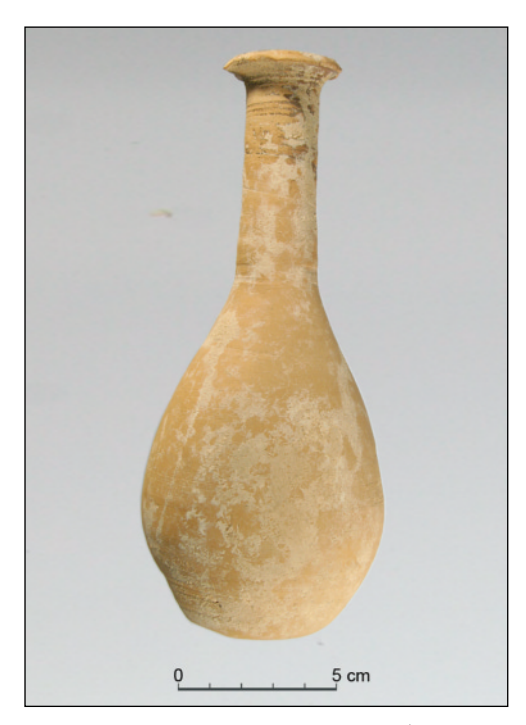
Fig. 5. Unguentarium, 1st century AD