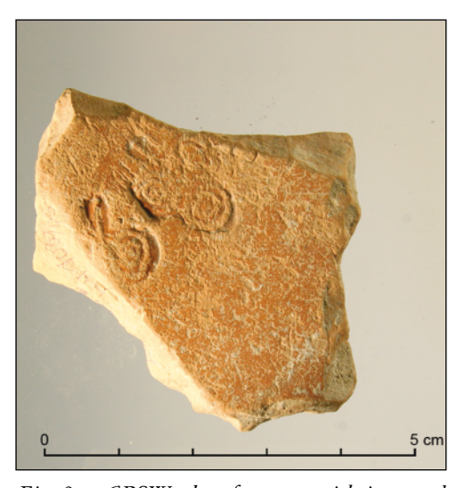
Fig. 3. CRSW plate fragment with impressed decoration, 5th-6th century AD