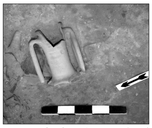
Fig. 1. Neck of pseudo-Kos/Dressel 2-4 amphora in situ, c. 125-150 AD

"Byzantine" wall) is made up of a very compact layer of shattered vessels, large pieces of which can be reconstructed. On the level at which the first sherds of this deposit were recorded (1.85 m), some remains of a human skeleton (a few teeth), victim of a quake, were found. Most of the deposit still needs to be reconstructed and analyzed, but it has already yielded a fragment of an Eastern Sigillata A plate with planta pedis stamp [Fig. 4], possibly of Late Hellenistic date, and a fragment of a big plate of Italian terra sigillata from the early Augustan period. The deposit, however, comprised mostly amphorae with a decidedly small share of tableware.