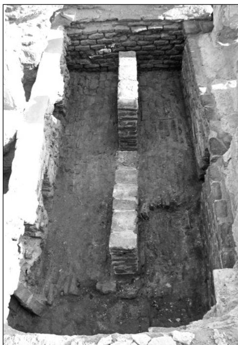
Fig. 1. Byzantine baths. Hypocaust F: before conservation (left) and after