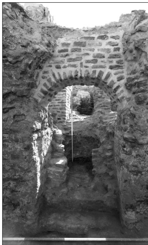
Fig. 2. Byzantine baths. Furnace O4: before conservation (left) and after