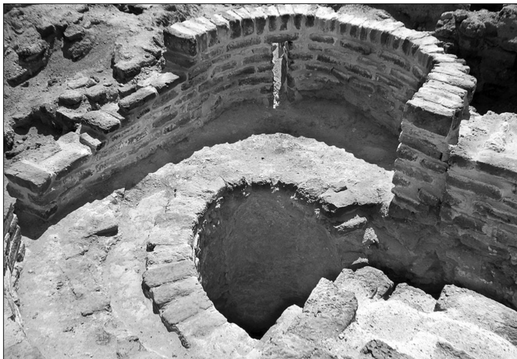
Fig. 3. Byzantine baths. Furnace O: before conservation (top) and after