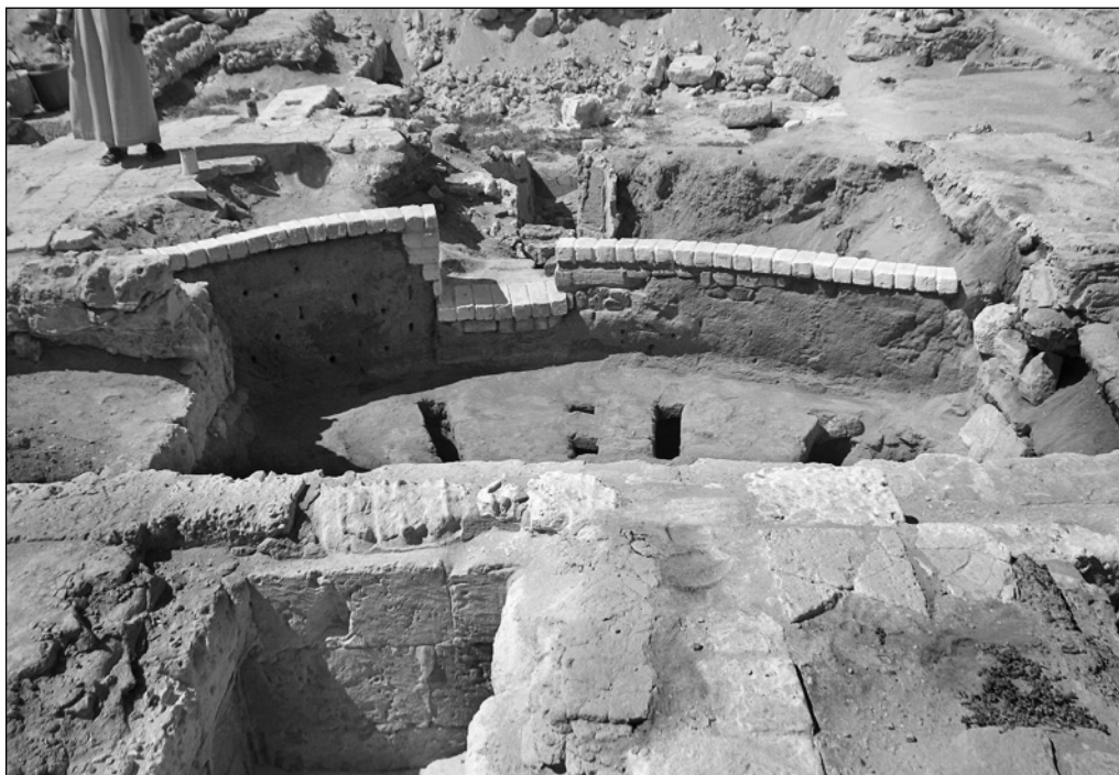
Fig. 4. Wall of the kiln for firing amphorae: before conservation (top) and after