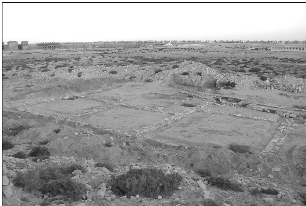
Fig. 6. General view of the cluster of rooms in Tr04 looking west; note wall of asblar blocks in the west side of the cut