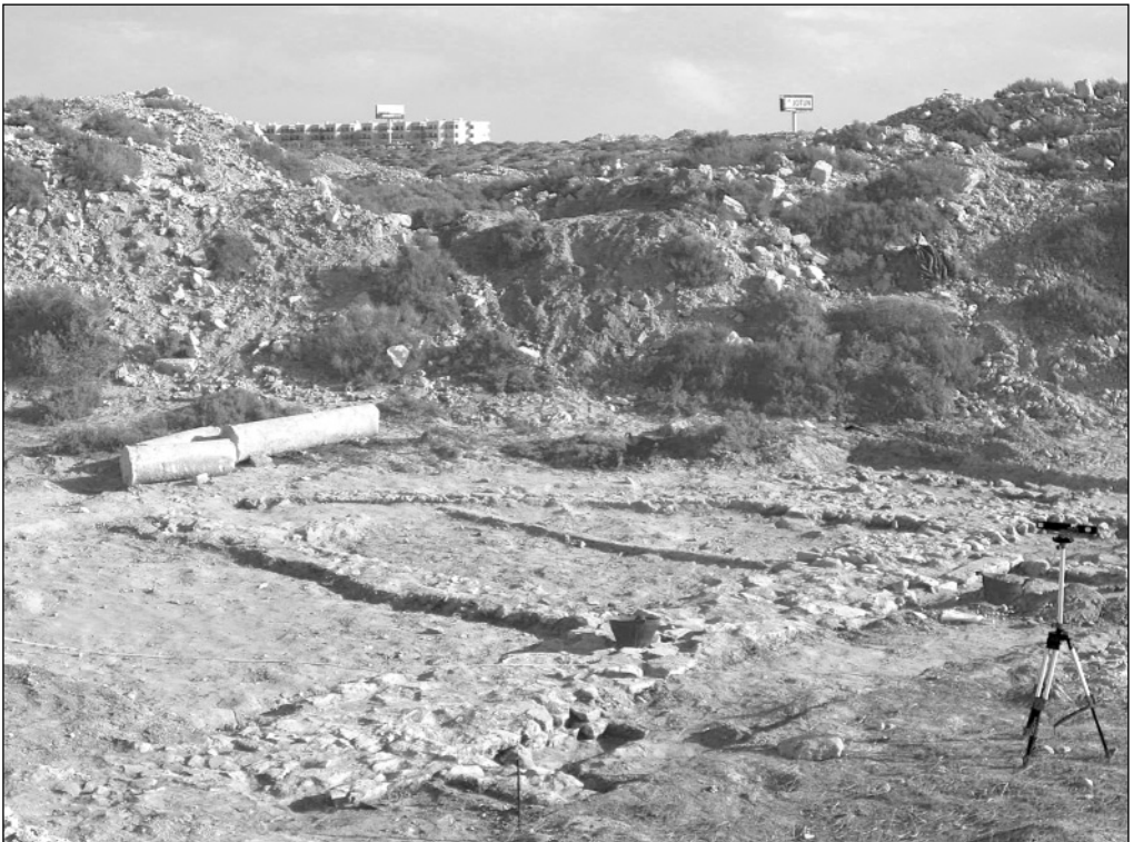
Fig. 2. One of the building dumps and the uncovered archaeological features in the western part of the bulldozed cuts (Tr05+07)

Careful monitoring of the removal and landscaping work proved the dumps sadly lacking of archaeological objects. Whatever diagnostic material was picked up, it was almost exclusively from the surface of the mounds, prior to the removal work. All the architectural members noted on the mounds' surface have already been registered and documented by R. Czerner of the Polish-Egyptian Conservation Mission (to be published soon in the BAR Series). Coming from the mounds were a few pieces of damaged architectural members (crumbling marble column shaft, two or three broken limestone column drums, heavily destroyed limestone Ionic