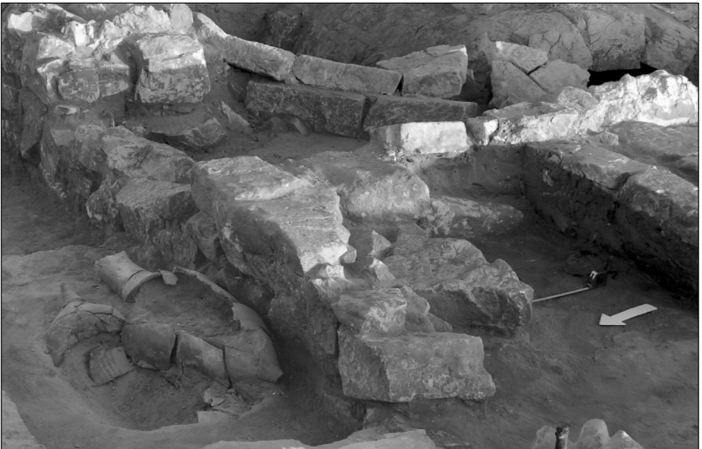
Fig. 13. Household area in Tr06 with bin containing amphorae on left and cistern with feeding channel for rainwater collected from the roof at center back and right, looking east