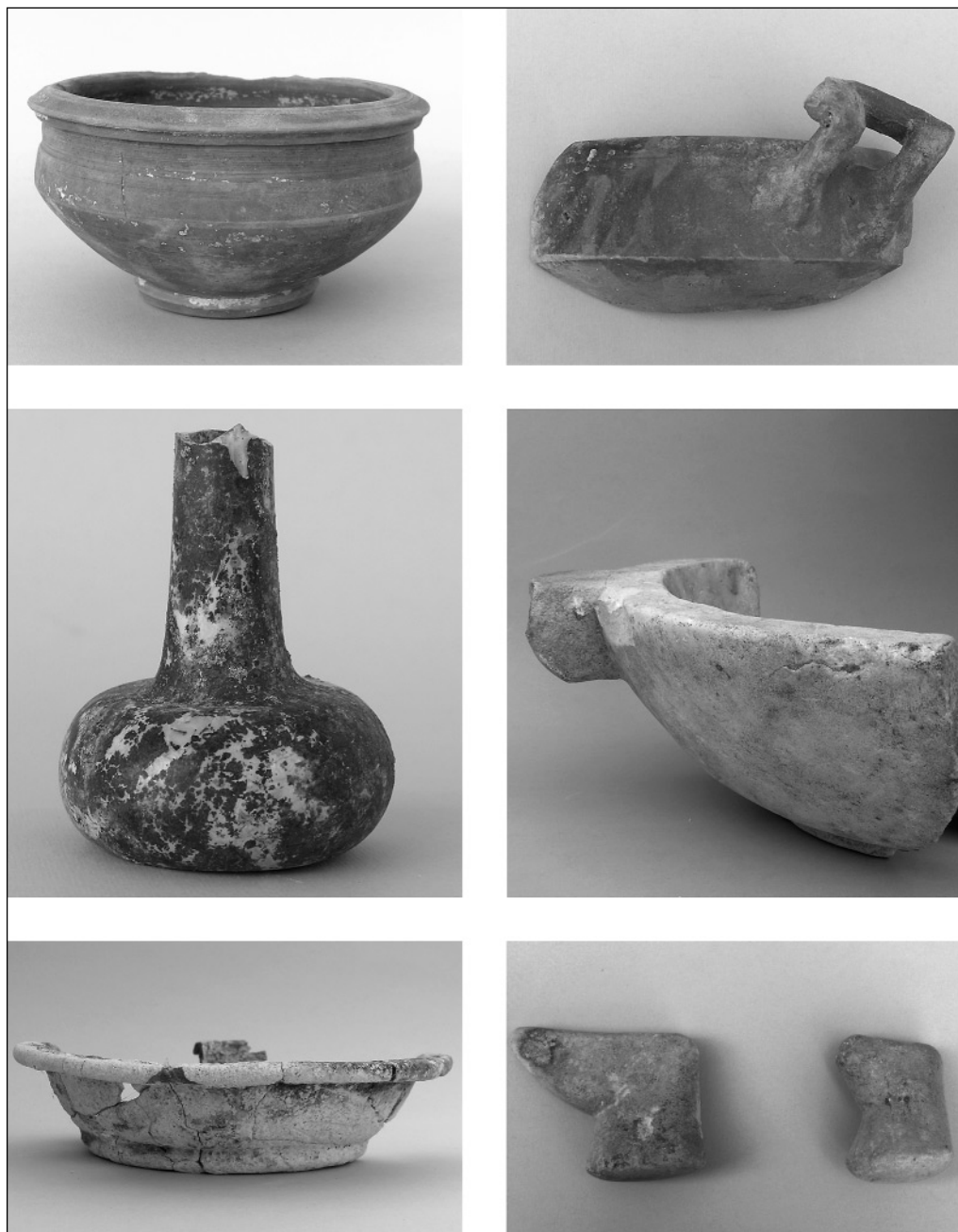
Fig. 11. Selection of finds from the survey (clockwise from top left): Cyprus sigillata krater P.40, 1st-century AD cooking pot, limestone mortar bowl, two limestone pounders with evidence of use on the working surfaces, 2nd-century AD faience bowl, glass unguentarium bottle of the 1st century AD