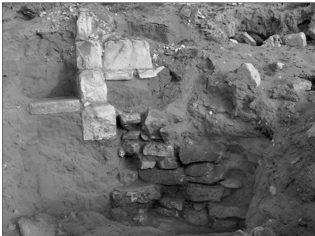
Fig. 14. World War II structure resting on top of ruined walls from the Roman age

The cistern functioned in association with a paved area used for some household activities, a small kitchen area perhaps and storage space (perhaps open courtyard) where a bin containing three amphorae, one with dipinti and another one a typical Rhodian import of the 1st century AD, was discovered [Fig. 13]. A small limestone altar was also discovered here. The building obviously extended to the north, into the side of the 'cut', where an ancient wall was found to touch a World War II trench built practically on top of it [Fig. 14]. (Indeed,