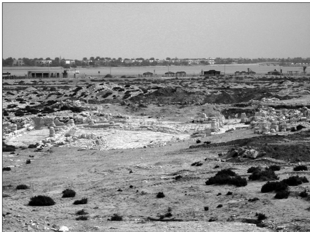
Fig. 3. The eastern side of the main town square following removal of the dump, view from the west

equipment. Once the tumbled debris of the underlying building started to appear on the surface, work in this area desisted [Fig. 3]. 2 Finds from the disturbed surface layer in this area included sizable quantities of broken marble tiles and slabs, possibly from wall revetment and floor paving, a lion's leg of limestone which could have been a bench support (in analogy to the supports found in the South Portico), and several pieces of architectural cornice decoration matching pieces found earlier in the area by the archaeological mission and obviously belonging to the