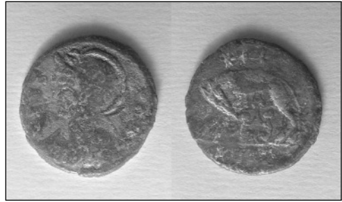
Fig. 4. Constantine's commemorative coin (AD 330-341), obverse and reverse

building still concealed under layers of sand here. A dating find is a coin of Constantine the Great, one of a commemorative issue struck in AD 330-341, on the occasion of building the new capital in Constantinople [Fig. 4]. It and two other unidentified coins came from a patch of ashes and burning found between the tumble of blocks, hence it can be assumed with fair certainty that it reflects late occupation of the town square and its surroundings.