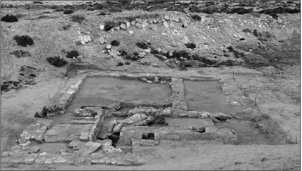
Fig. 12. General view of Tr06 with cistern in foreground, looking northwest; note remains of WWII structures in the western side of the cut