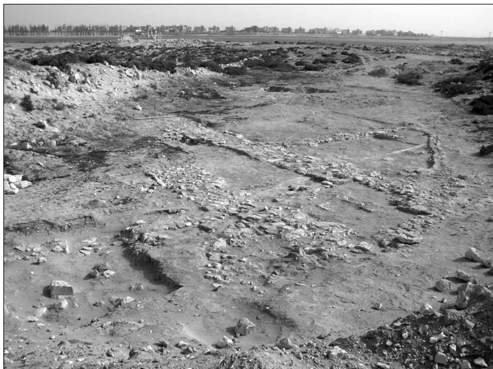
Fig. 5. View of the western cut looking north – ancient walls bulldozed at floor level; the pit at center back marks the position of a sunk exedra

By sheer chance the structures recorded in both cuts turned out to be of domestic nature, the 'back doors', so to speak, of private houses, such as have already been recorded, studied and restored further east in Marina (see previous reports in earlier volumes of PAM ). Clusters of rooms have been recorded, none representing a complete structure. In all cases, walls either continued into the sides of the 'cuts' or were destroyed and could not be traced