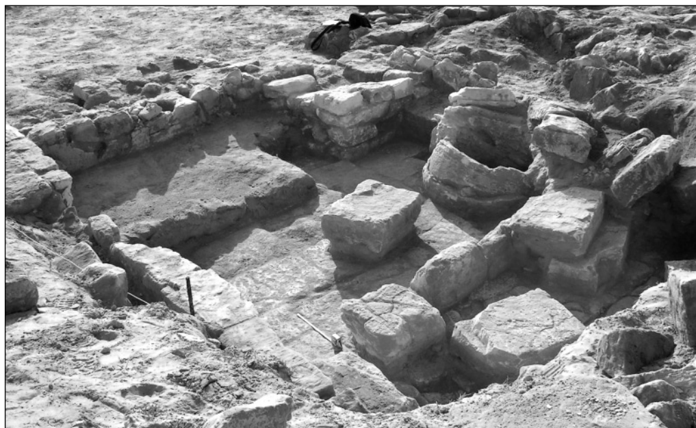
Fig. 9. Paved unit with well (to right), fireplace and bin in Tr01, looking northeast; the channel under the platform (photo at top right) was fed from a drain in the corner of the room and emptied into the well structure; the vertical drain in the wall above the channel was not connected with it