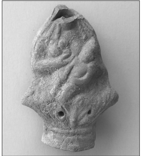
Fig. 10. Isis nursing Harpocrates, lamp handle attachment (bottom right) and “Frog”-type lamp from Tr01; Cretan ivy-leaf lamp from Tr04