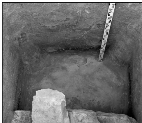
Fig. 7. Channel feeding a cistern in Tr04, view looking northeast (left) and detail of one end of the cistern with water-proofed plastering on the walls and characteristic corner projections