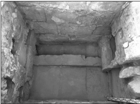
Fig. 8. Latrine(?) compartment in a building in Tr03, top view. The entrance to the room was from the west (to the right in the photo) and the channel emptied into a street outside through a triangular hole in the east wall. Some kind of permanent seating had been installed above the channel

A curious depression in the ground must have existed already in antiquity between the present trenches Tr03 and Tr01. Apparently, once the building with latrine had collapsed (it was already half full of sand at this time and the level of sand outside was even higher), it was not rebuilt, unlike the neighboring structures described above. The ruins lay in a hollow that filled out quickly with pure sand and remained open ground until the end of the city's days. This open stretch of ground, some 40-50 m long, ended with another cluster of rooms, representing possibly two complexes joined by back-to-back walls (Tr01). One of the two complexes consisted of a paved area with a cistern and bin in the