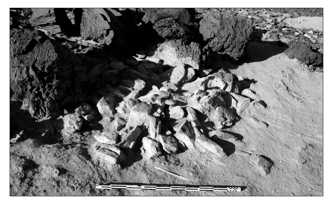
Fig. 1. Grave 2 at the El-Ar 7 site