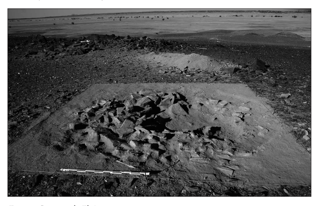
Fig. 2. Grave 3 at the El-Ar 7 site