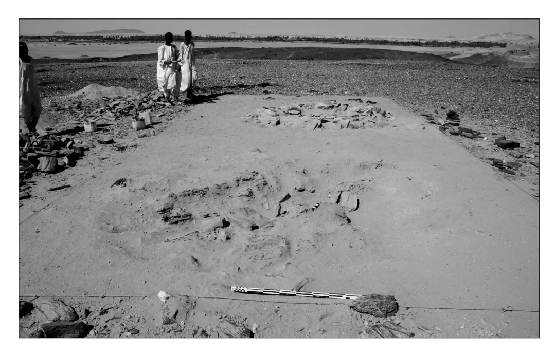
Fig. 3. The two tumuli excavated at site El-Ar 29