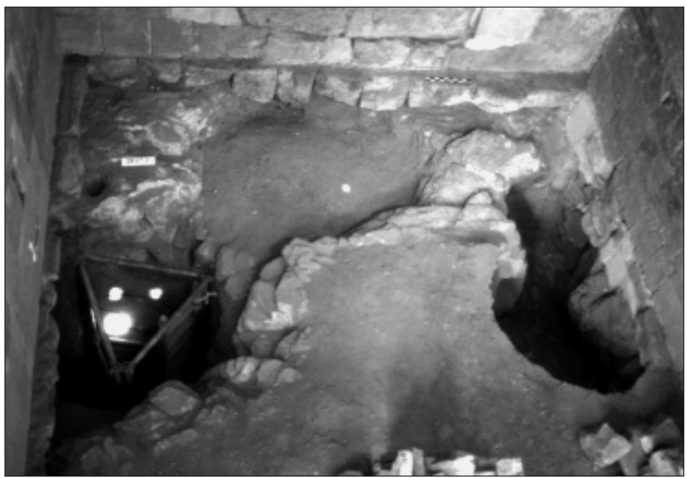
Fig. 3. Three shaft tombs in the western part of the Mortuary Chapel of Hatshepsut