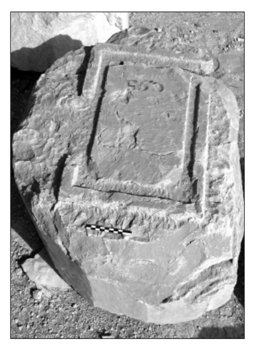
Fig. 2. Offering table made of a fragment of limestone column originating from the temple