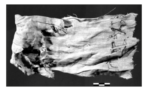
Fig. 5. Bandage dated to the 27th regnal year of king Usermaatre found in shaft tomb 8