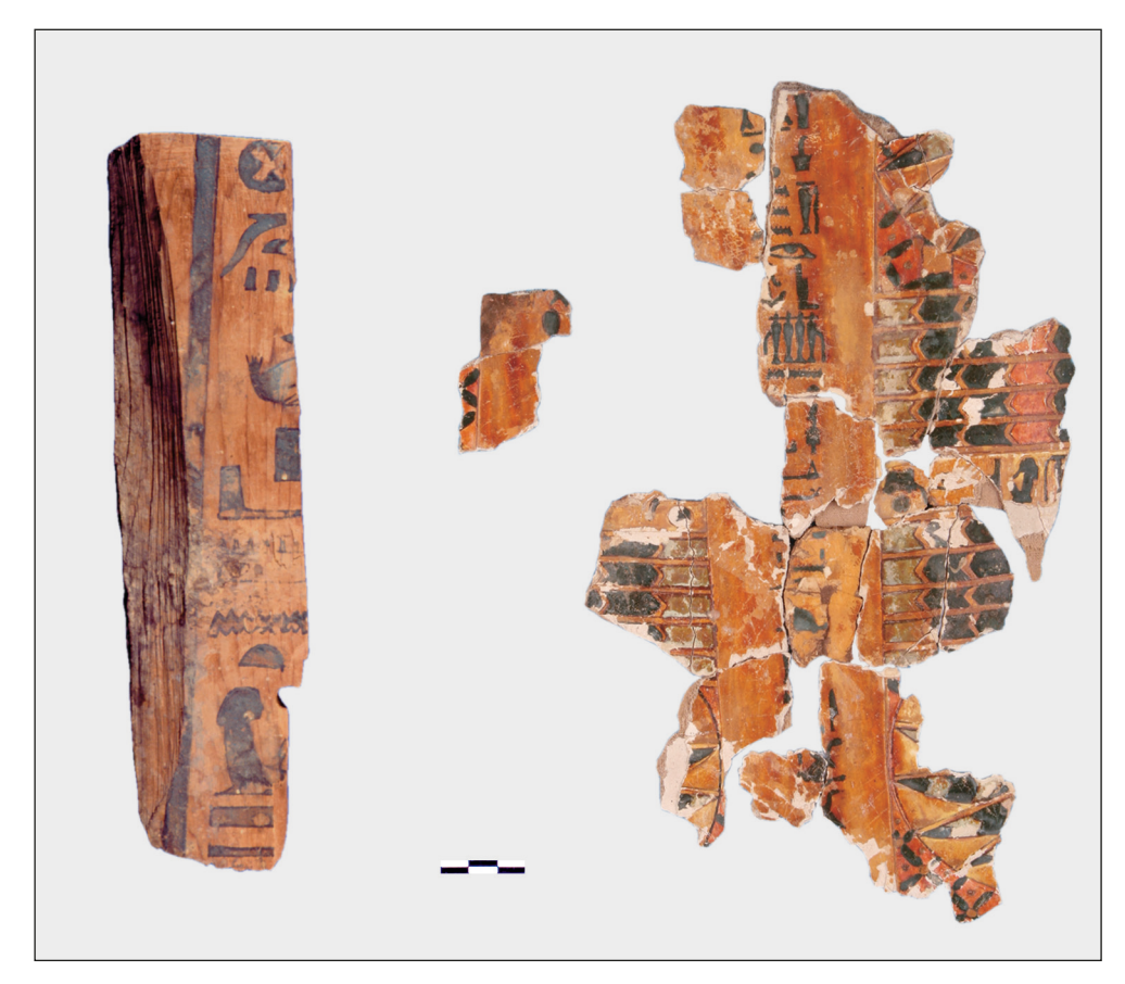
Fig. 7. Fragment of the sarcophagus, left, and cartonnage of vizier Padiamonet, the latter reconstructed by A. Niemirka

To complete this genealogical survey, three shaft tombs should be mentioned, located by the Polish team in 2000 in the so-called Northern Chapel of Amun on the northern side of the upper terrace (see Barwik 2003). At least four persons buried there were identified on the ground of the names and their titles inscribed on fragments of coffins, sarcophagi and carton-