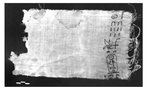
Fig. 6. Bandage inscribed with the name of vizier Padiamonet; from shaft tomb 8