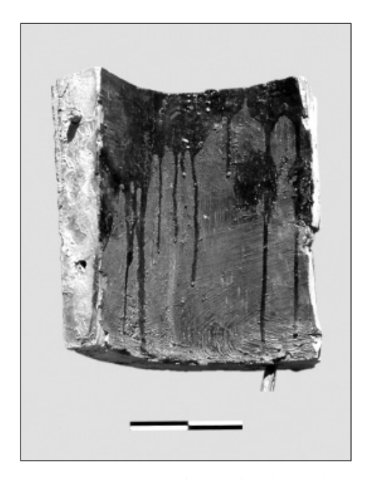
Fig. 8. Fragment of coffin found in the Northern Chapel of Amun with traces of resin coating inside