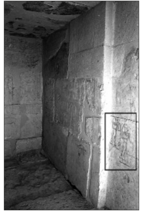
Fig. 1. Southern niche in the open courtyard of the Solar Cult Complex with red-painted figural graffiti, left side of entrance (left) and right side