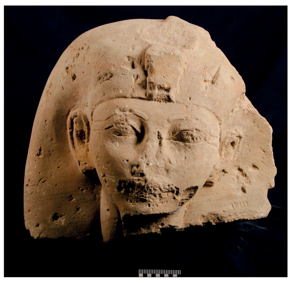
Fig. 1. Winlock's Head F, current state of preservation after dry cleaning

Originally there were about 60 statues along the Causeway leading from the Bark-Station halfway from the Valley Temple to the Upper Temple's Main Gate and another 12 to 14 sphinxes in its Lower Court, the average distance between successive statues being 15.50 m (Hauser Notes ).