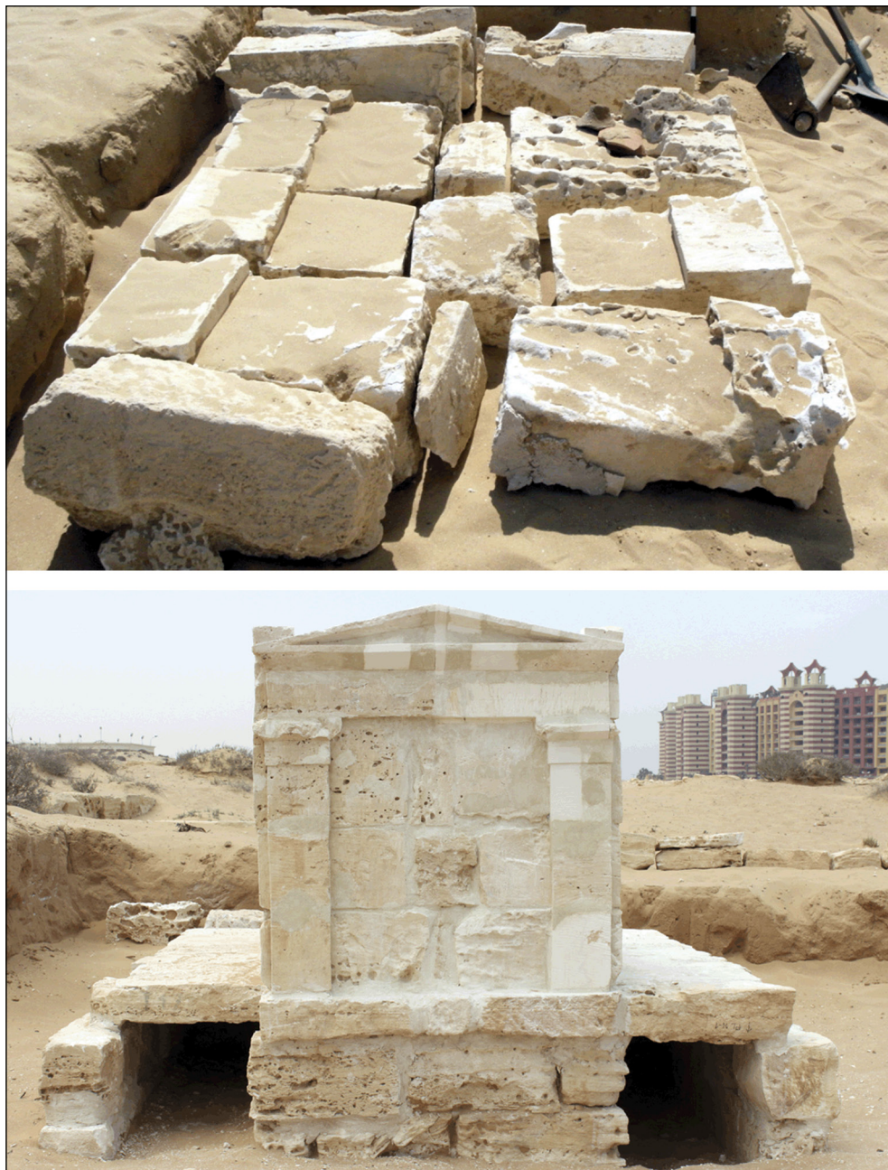
Fig. 2. Elements of the facade of tomb T17, before (top) and after conservation in 2011