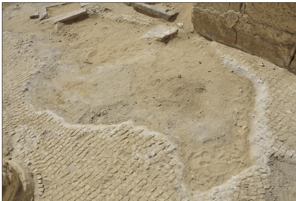
Fig. 4. Southern Baths, southern portico of courtyard 4 after conservation of the floor mosaic