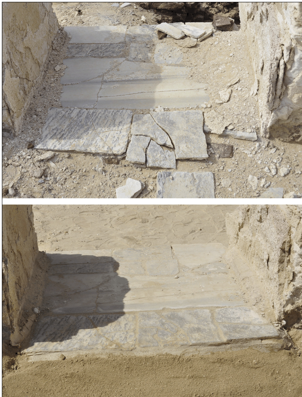
Fig. 3. Floor in the passage between rooms 6 and 7, before (top) and after conservation