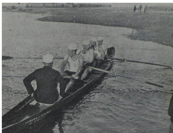
Fig. 5. One of the rowing settlements of the Wronki “Temida”

on rivers, as presented earlier: Luck on the Styr and Wilejka on the Wilia river. In 1935, the construction of the rowing marina on the Warta was completed by employees of one of the largest prisons in Poland –Wronki. The opening ceremony of the facility, dedication and giving the name “Temida” took place in the presence of invited guests from Warsaw and Poznan as well as the authorities of the local prison. With the fleet of several rowing boats and some tourist canoes Prison Guard officers were active until the outbreak of war 30 .