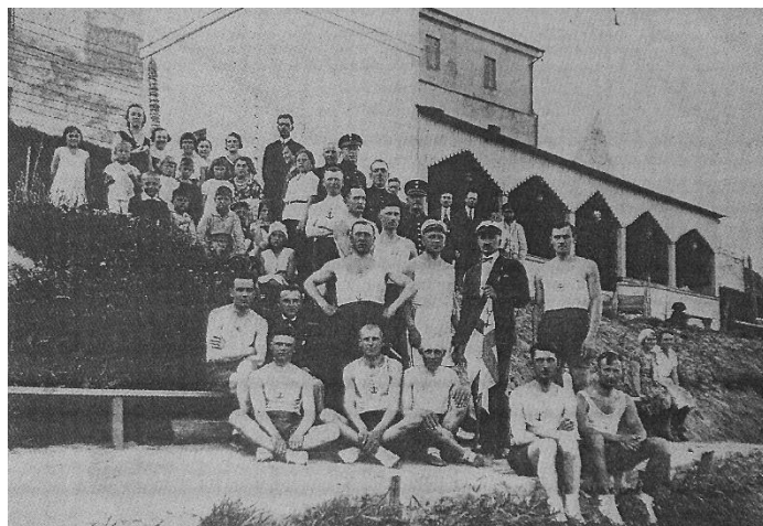
Fig. 3. The opening of the season in the Rowing Club “Temida” in Luck on May 15, 1932