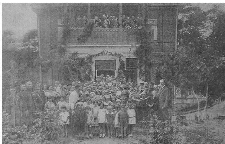
Fig. 1. Prison employees' children camps in the Health and Medical Resort "Orla Strzecha"

area and their families, both for a longer stay, as well as short stays in on Sundays and public holidays. Day trips organized on 15 August and 15 September, when the Health House was visited by about 100 prison employees' children from Warsaw, were the most popular. Childcare and organizing various types of movement games and recreational activities were entrusted to the representatives of the individual departments, who expressed readiness to do social work with children 18 .