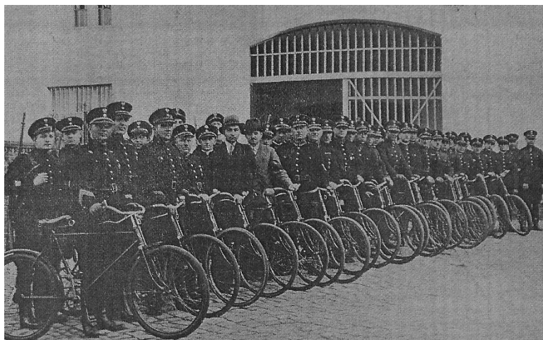
Fig. 6. The team of cyclists from the prison in Rawicz