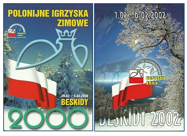
Fig. 4, 5. Front pages of bulletins of the 4th and 5th World Polonia Winter Games

The World Polonia Winter Games 'Beskids 2000' smoothed the way for the organization of subsequent Polonia sports meetings, which was due to the Bielsko-Biała Branch of 'Polish Community'. The next four winter games, carried out in the new formula, were again held in the Beskidy and Silesia<sup>12</sup>.