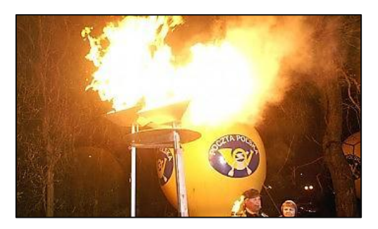
Fig. 10. Opening ceremony of the 8th World Polonia Winter Games. Szczyrk 2008.

fication with a total of 42 medals, the Polonia athletes from Russia took the second place with 30 medals, and the third place went to the Swedish Polonia representatives, who won 26 medals<sup>20</sup>.