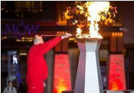
Fig. 16, 17. Opening ceremony of the 12th World Polonia Winter Games in Arlamów

Source: http://wiadomosci.wspolnotapolska.org.pl/impreza/9/Zimowe-Igrzyska-Polonijne; http://igrzyska zimowe.wspolnotapolska.org.pl/aktualnosci/50/Otwarcie-Igrzysk-galeria [accessed: 4.11.2016).