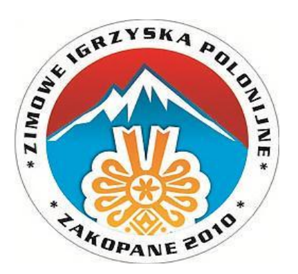
Fig. 11. The badge of the 9th World Polonia Winter Games. Zakopane 2010.