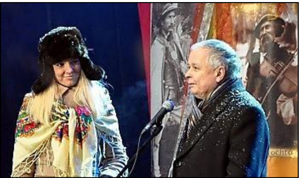
Fig. 12, 13. Opening ceremony of the 9thWorld Polonia Winter Games in Zakopane (2010), attended by the President of the Republic of Poland, Lech Kaczyński