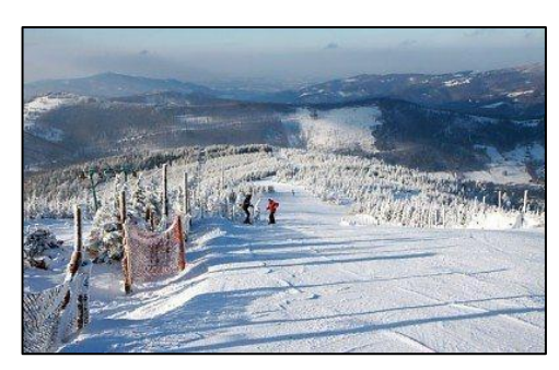
Fig. 6. 4th World Polonia Winter Games. Szczyrk 2000.

[...] I am confident that the organizers – the Association 'Polish Community' and the winter sports associations – will make every effort to ensure that the Polonia athletes feel at home in the 'old country', that they are surrounded with a cordial, family atmosphere, and experience positive emotions not only connected with rivalry in the sports arena, but also with discovering their roots in the Polish culture, language and landscape<sup>15</sup>.