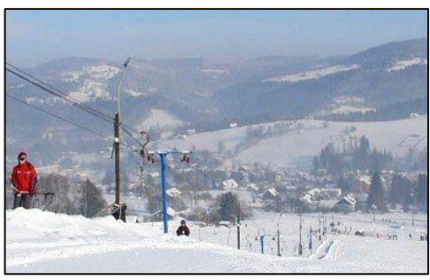
Fig. 9. 7th World Polonia Winter Games. Szczyrk 2006.