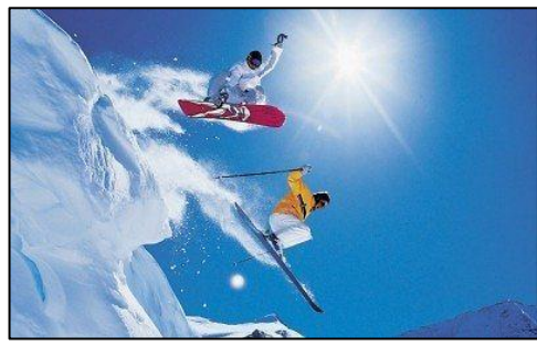
Fig. 7. 5th World Polonia Winter Games. Szczyrk 2002.