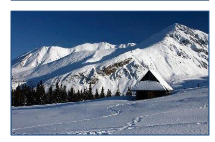
Fig. 3. The 3rd Polonia Winter Games. Zakopane 1992