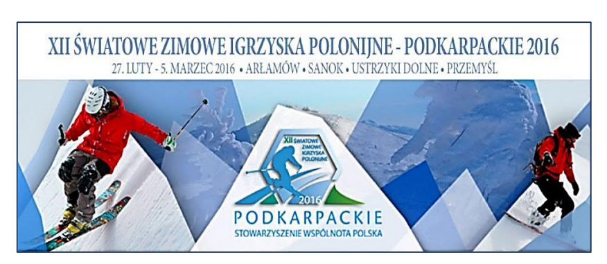
Fig. 18. Poster of the 12th WPWG. Podkarpackie 2016