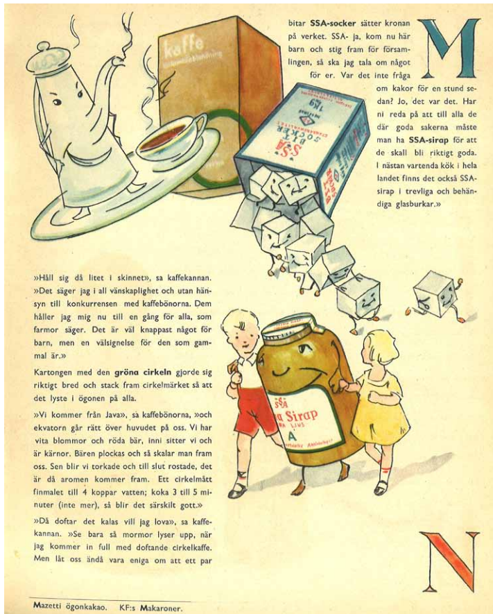
Fig. 4. © Atelier E.O. Per and Lisa's Christmas Citchen (1935)

proposes that “once the toy becomes animated, it initiates another world, the world of the daydream. The beginning of narrative time here is not an extension of the time of everyday life; it is the beginning of an entirely new temporal world, a fantasy world parallel to (and hence never intersecting) the world of everyday reality” (Stewart 1993: 57).