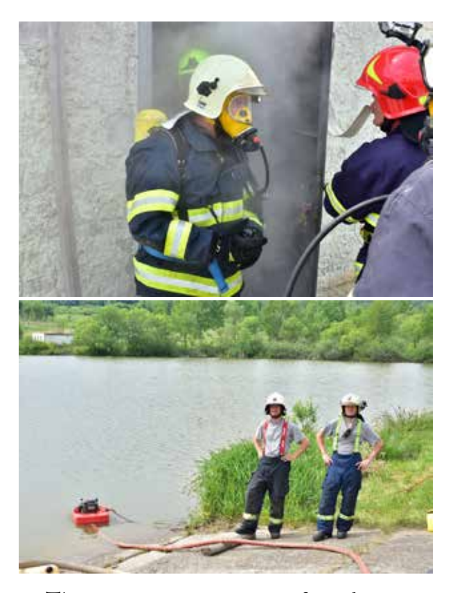
Figure 2 Fireman has left the cocoon of the neck therefore not protected. Firefighters at right has deployed emergency clothing

The most common causes of accidents wrong use of personal protection equipment (PPE) can be classified wrong size emergency clothing or gloves, unstretched premium loops through the thumb, which prevents