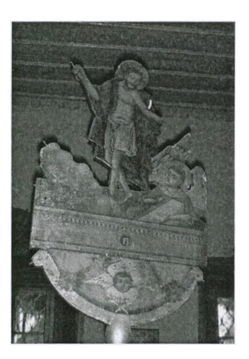
Fig. 5. Labarum (bifacial representation); 1893. Work of Stavros Margaritis from Kolakia (Nea Panagia Thessalonikis – Storehouse)