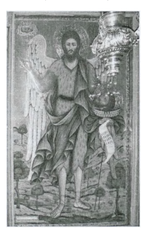
Fig. 7. St John The Precursor. Hand of Dimitrios Lampou from Kolakia, 1844 (Temple of Hypapante, Thessaloniki, dimensions: 110 x 73 cm)

While studying the art of these painters, one may notice some common stylistic characteristics which are: the background is rarely golden and in case it does not bear any architectural elements (Fig. 4) - which are synoptically and schematically declared - or the depiction of a natural landscape (Fig. 7), it is divided in two levels (Fig. 6). The floor is often depicted abacus-shaped (fig. 6) or with multicolor strokes (Fig. 1). The frames are also adorned in the same manner and they are defined by a white tape internally, which bears anthemia and spots in the corners, and by a black one externally. The figures are large (Fig. 1), unless the representation depicts many persons, the faces of young persons are oval, while the elder are characterized by oblong faces. Common elements among painters from Kolakia constitute the dark proplasms in the depiction of sarcomas, intense writings for the depiction of facial characteristics, intense almond-shaped eyes, profile-depicted noses, and the contour of the lips and wrinkles (Fig. 2). The garments are depicted with dark colors, they bear anthem decoration (Fig. 1), while the pleats are not