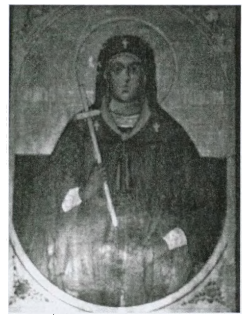
Fig. 9. Sta. Theodora (Sta Theodora Kolindrou, dimensions: 30 x 23.5 cm)

Their ability to adopt in a most flexible fashion to the artistic demands of their age leads them to pioneer in the artistic field of the 19<sup>th</sup> century and to contribute dynamically to the evolution of religious painting.