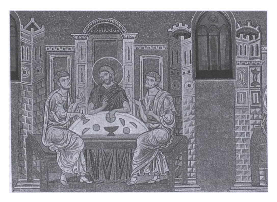
Fig. 6. The supper in Emmaus. Monreale cathedral mosaic. 1180–89 (after The cathedral of Monreale )

A table and seats were placed on the platform. There was a variety of the drama comments, one of them informed the reader by such words: "Quo cum ascenderint et ad mensam ibi paratam sederint, et Dominus inter eos sedent panem eis fregerit..." ("Where they ascended and sat down at the table which was standing where the Lord sitting between them divided the bread for them...").