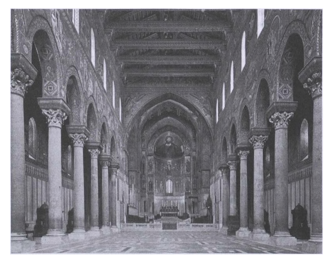
Fig. 5. Monreale cathedral. The main nave. 1180-89 (after BELLAFIORE 1966)

The drama comments point out that it is necessary to have for the action of the second scene "tabernaculum, in medio nauis ecclesie, in similitudinem castelli Emmaus preparatum"<sup>18</sup> ("the structure in the middle of the nave of the church, prepared in the likeness of the fortress Emmaus"). It was erected usually as a platform, with a structure on the back where the curtain was fastened more often<sup>19</sup>. The architectural design of two mosaic compositions on the theme of the supper in Emmaus looks like a wall with three wide apertures and two towers on the sides. It is similar the architectural background of the miniatures of the manuscripts from England. It can be suggested that the architectural background of the mosaics and the miniatures represents a real «theatrical requisite» of the performance. Thus, the architectural design of the mosaic compositions is quite comparable with that of the church, which had a scenic platform once arranged in its nave.