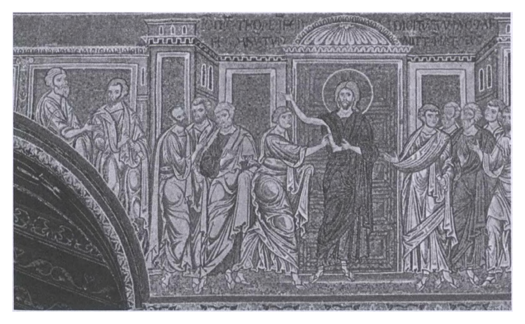
Fig. 2. The Incredulity of Thomas. Monreale cathedral mosaic. 1180–89 (after The cathedral of Monreale )

E. Kitzinger thinks that the proof of iconographical borrowing by the Monreale mosaic artists of Christ's Appearance to the Emmaus travellers is to be found in the illustrations of the St. Albans Psalter (1120–30), which contains the three scenes with the Emmaus travelers (Hildesheim, Dombibliothek, MS St. Godehard 1 , p. 69–71)<sup>10</sup>. These scenes obviously reflect the influence of Peregrinus liturgical drama in their detail. The Manuscript of Eadwine Psalter of the twelfth century (Victoria and Albert Museum, MS 661 ) also contains three miniatures with similar iconography<sup>11</sup>.