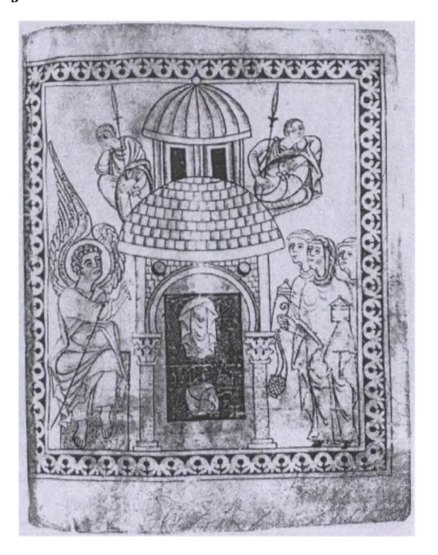
Fig. 11. The three Marys at the tomb. The miniature of the manuscript. San Gall, Stiftbibliothek, MS 391, p. 33 (after YOUNG 1933)

All of this testifies that the Byzantine artists who worked in Monreale were moved by performances of the liturgical dramas they personally had seen, most likely, in Palermo churches, and in Monreale cathedral in particular. Possibly these Constantinopolitan artists had found it quite admissible to scoop out those new sources of artistic impressions because they considered