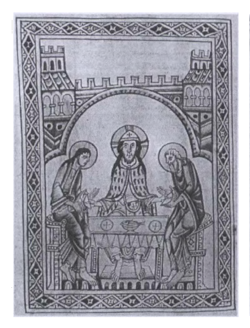
Fig. 7. The supper in Emmaus. The miniature of the St. Albans Psalter . 1120–130. Hildesheim, Dombibliothek, MS St. Godehard 1 , p. 70 (after KITZINGER 1995).