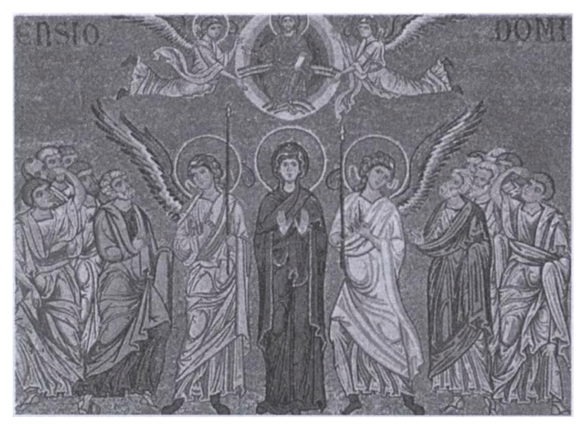
Fig. 9. The Ascension. Monreale cathedral mosaic. 1180–89 (after The cathedral of Monreale )

Besides, an artistic interpretation of these five compositions has a number of differences with artistic interpretation of the majority of other New Testament scenes of Monreale. First of all it is possible to name their special staginess which we understand as a precise correlation of figures in space and personal communication of personages, expressed by looks, turns of heads, poses and gestures. Each personage has individual emotional expression on his face. These features makes the compositions different from, for example, "The Ascension" (fig. 9) or "The Descent of the Holy Ghost" (The Pentecost) on the same northern wall of the transept. This difference can be explained by the fact that the source of expressionism of the mosaic scenes with the Emmaus travellers in Monreale lays in performances of the Peregrinus drama, their stage settings and the manner of their action.