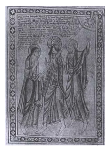
Fig. 3. The meeting on the road to Emmaus. The miniature of the St. Albans Psalter . 1120-30. Hildesheim, Dombibliothek, MS St. Godehard 1 , p. 69 (after KITZINGER 1995)

The majority of drama texts indicate that the first scene, the meeting on the road to Emmaus, was played in the main nave<sup>13</sup>. This scene looked especially impressive in the Monreale cathedral. As we know, in the eastern part of Monreale cathedral there was a high solid barrier (or transenna) with an arch aperture in its centre and two pulpits on columns before it<sup>14</sup>. A similar choir-screen, dated back to 1180, can be seen in San Matteo cathedral in Salerno<sup>15</sup> (fig 4). It represented Jerusalem not only in a symbolic manner. It was even reminiscent of a real city wall with the towers and the central cathedral nave which led to it surely being meant to represent the road to Jerusalem<sup>16</sup> (fig. 5). Clergymen repre-