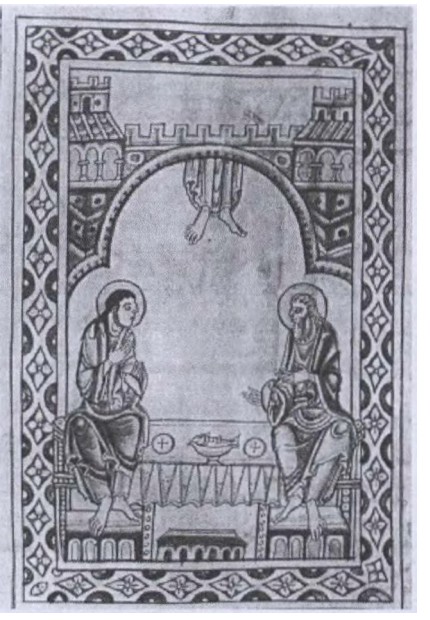
Fig. 8. Christ' disappearance at the supper in Emmaus. The miniature of the of St. Albans Psalter . 1120–130. Hildesheim, Dombibliothek, MS St. Godehard 1 , p. 71 (after KITZINGER 1995)

In the third scene one of the illustrators of the manuscripts has depicted Christ's disappearance as His Ascension (fig. 8), the other as the action of walking away. The author of the mosaic shows the empty space shining gold in the wall where Christ was standing (fig. 1). This image is closer both to the text of the Gospel, and to the Comments of the drama from Sicily: "... ac post ab oculis eorum euanescat"<sup>22</sup> ("... after it He vanished out their sight"). The clergyman playing the role of Christ in the performance disappeared immediately. Possibly, he hid himself behind a curtain or under a tablecloth.