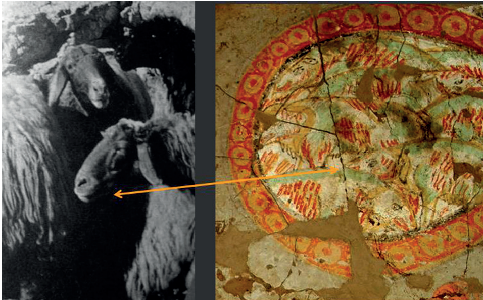
Fig. 10. Sheep corralled in a circular zeriba – fragment of the painting from Southwestern Annex from Old Dongola Monastery