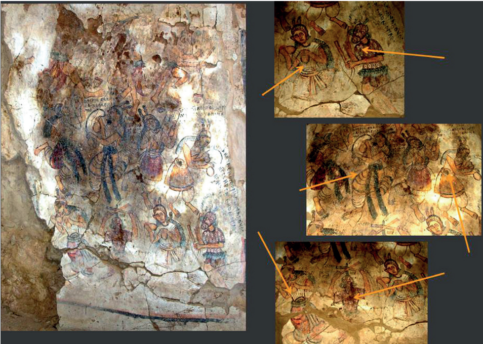
Fig. 12. Dance composition from Southwestern Annex from Old Dongola Monastery