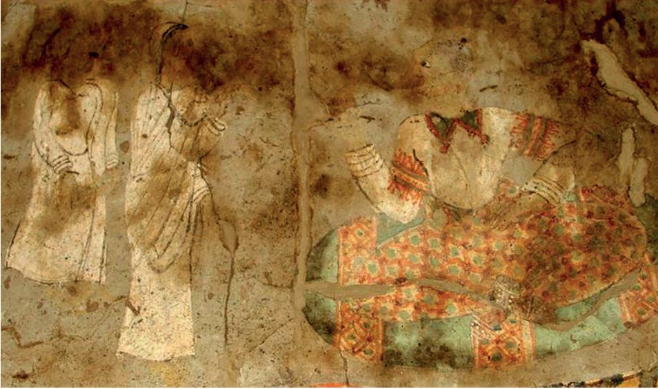
Fig. 11. Tobias and Sara greeted by Raguel – fragment of the painting from Southwestern Annex from Old Dongola Monastery