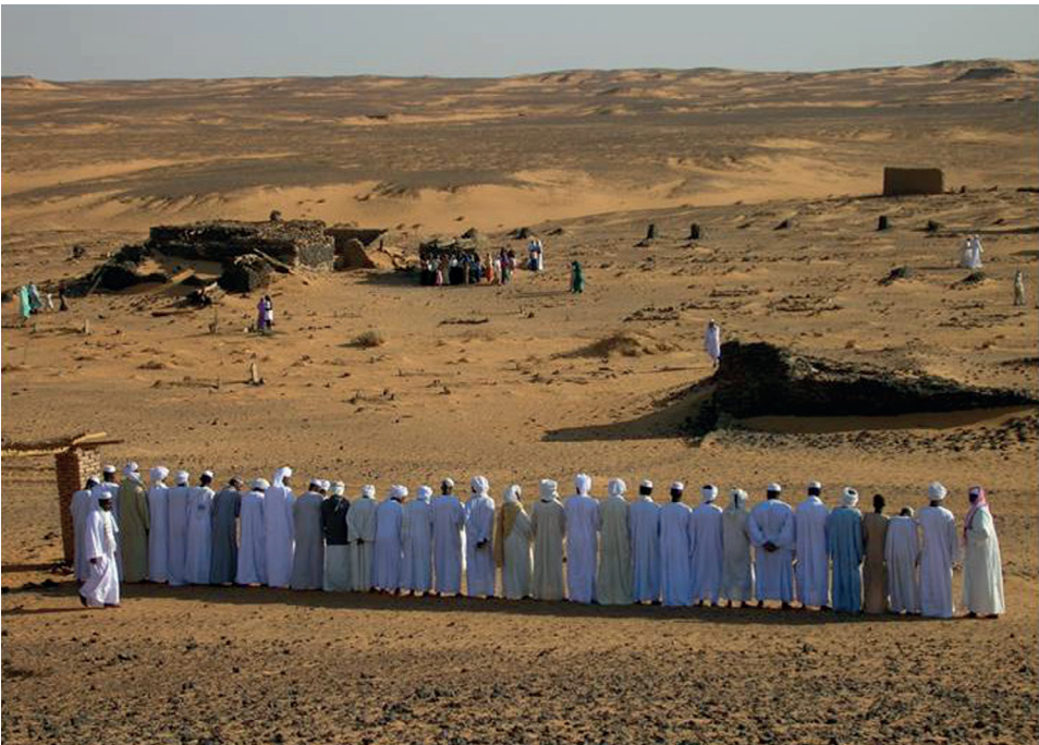
Fig. 16–17. Pictures of the Arabic culture of the contemporary Sudan