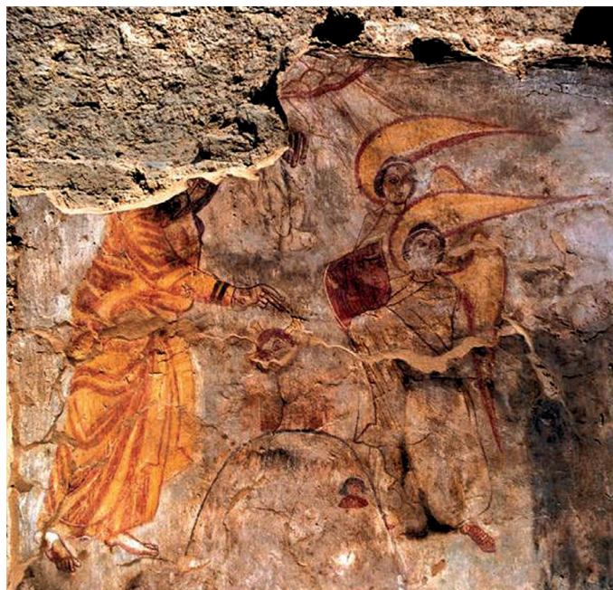
Fig. 7. Baptism of Christ from Northwestern Annex from Old Dongola Monastery