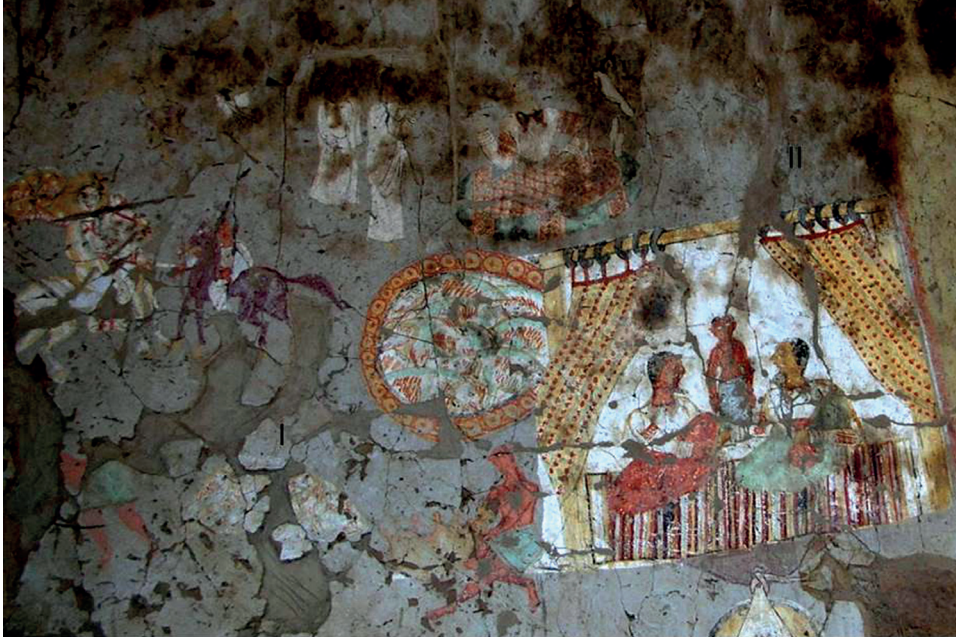
Fig. 9. Story of Tobias – painting from Southwestern Annex from Old Dongola Monastery