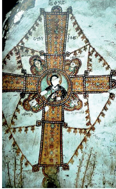
Fig. 5. Votive Cross with Christ at the centre – Sudan National Museum in Khartoum