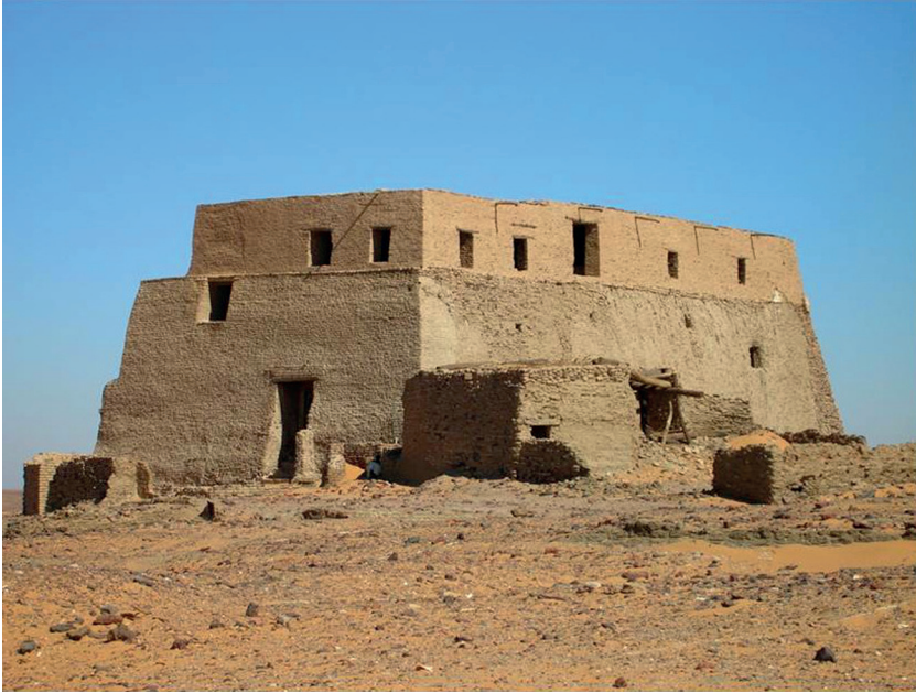
Fig. 2. The royal palace in Dongola converted into a mosque