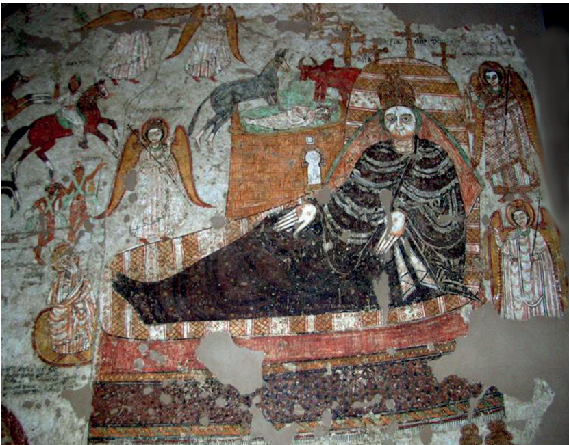
Fig. 3. Nativity from Faras Cathedral – Sudan National Museum in Khartoum