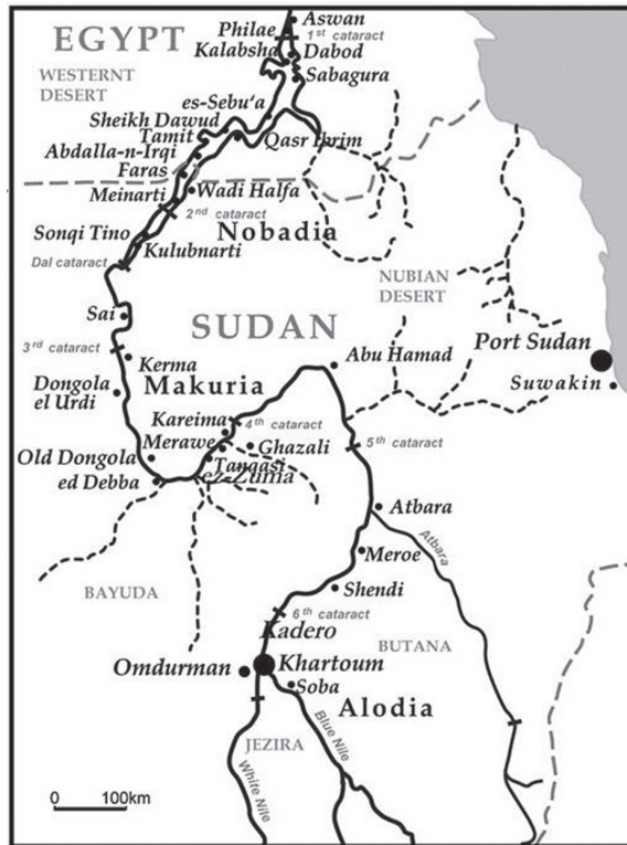
Fig. 1. Sketch Map of the Nubian kingdoms in the Middle Nile Valley

The abode analysis clearly shows that the culture of Christian Nubia, originally based to considerable extent on Byzantine art, in course of time subjected to more and more intense Arabic influence, significantly changed. Arabic components became predominant, which over following centuries led to creation of Arabic culture of the contemporary Sudan (Fig. 16, 17, 18, 19).