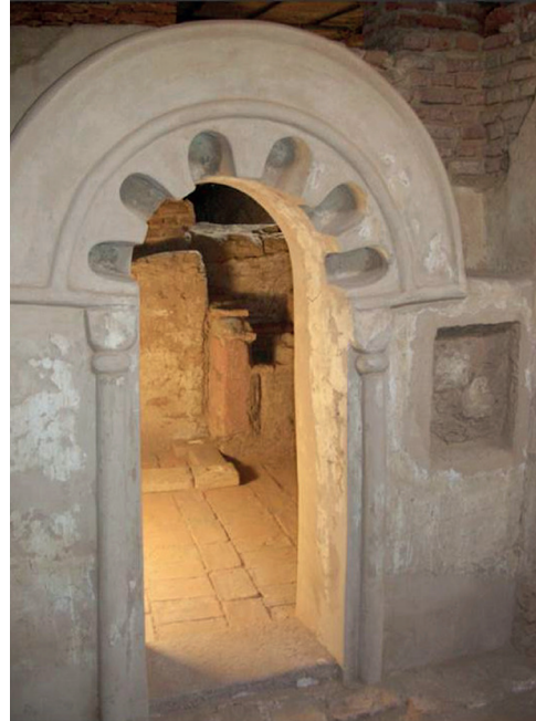
Fig. 14. Doorway giving access to commemorative part with grave recesses in North-Western Complex on kom H in Dongola