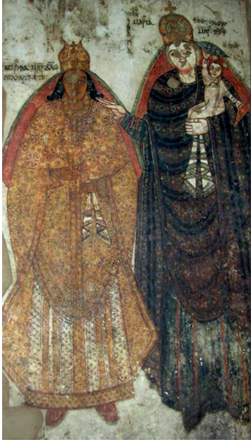
Fig. 4. Martha Mother of the King under protection of St. Mary with the Child – Sudan National Museum in Khartoum