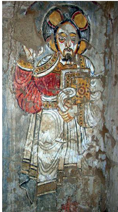
Fig. 6. Christ from Northwestern Annex from Old Dongola Monastery