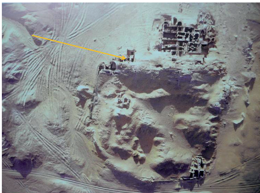
Fig. 8. Monastery compound on kom H in Old Dongola