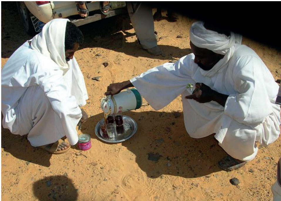
Fig. 16–19. Pictures of the Arabic culture of the contemporary Sudan