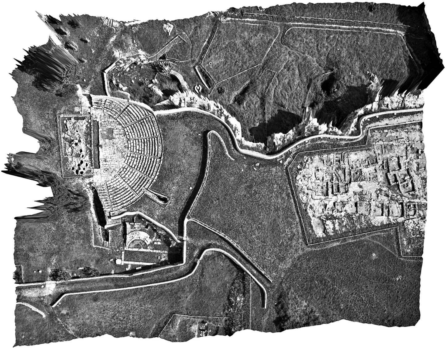
Fig. 1. 3D model of archaeological relics and topography (by M. Bogacki). Ryc. 1. Trójwymiarowy model terenu i pozostałości archeologicznych.