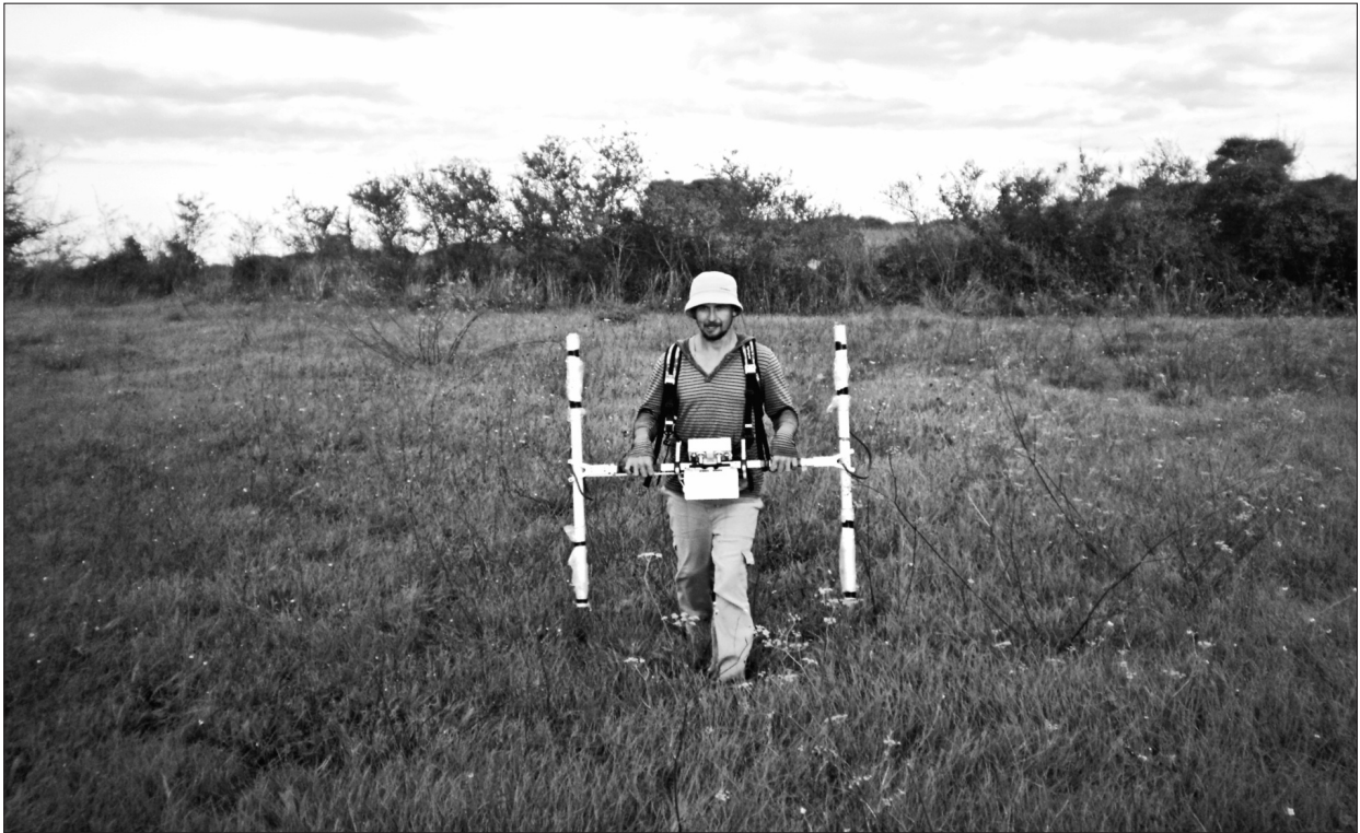
Fig. 2. Geophysical survey.