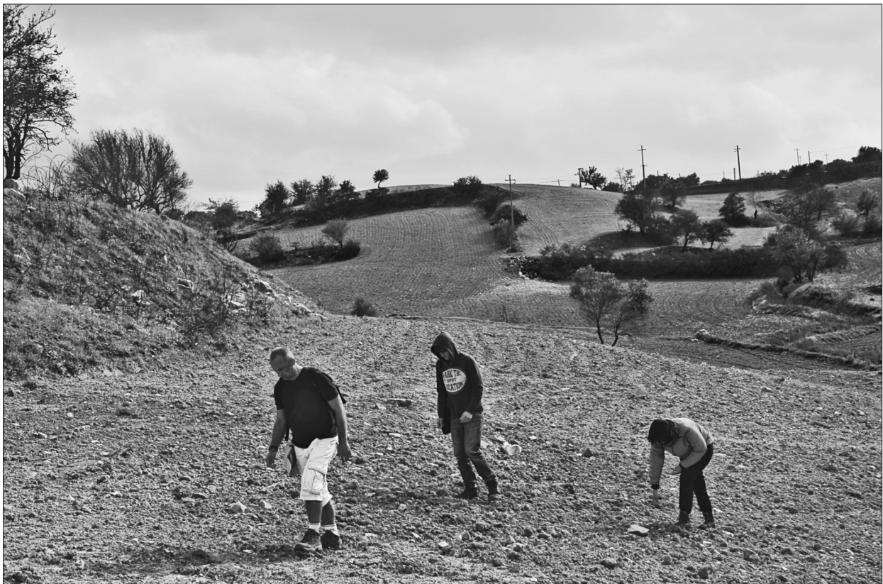
Fig. 3. Field survey in 2010.

Ryc. 3. Badania powierzchniowe w 2010 r.