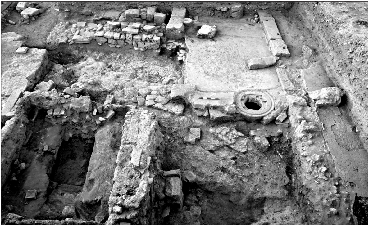
Fig. 2. General view of the southern trench, with a kiln built directly over a rock in the foreground.

Ryc. 1. Fragment dziedzińca z kamiennym płytowaniem (R68/69), w centrum: impluvium z mozaiką.