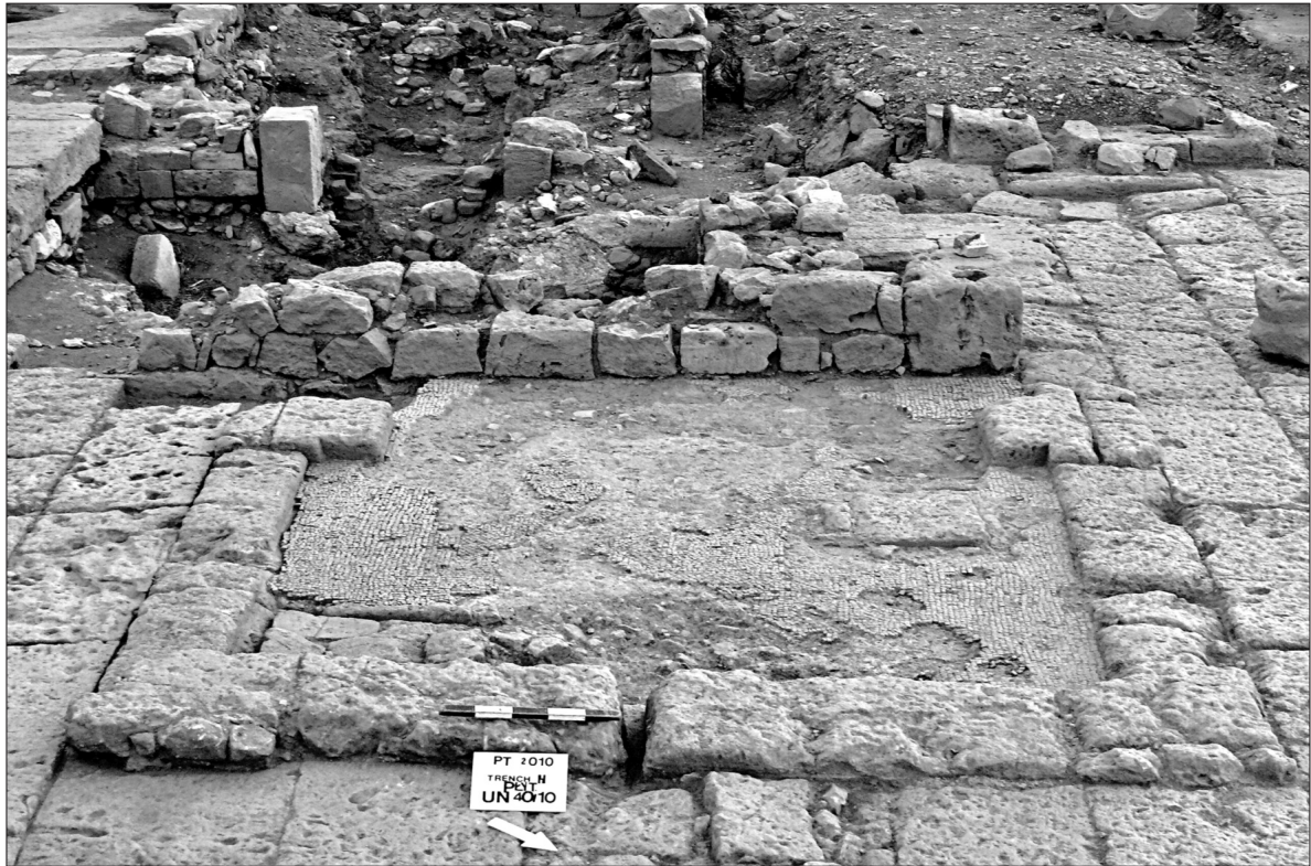
Fig. 1. Fragment of the courtyard paved with slabs (R 68/R 69); at the centre: impluvium laid with a mosaic.

Ryc. 1. Fragment dziedzińca z kamiennym płytowaniem (R68/69), w centrum: impluvium z mozaiką.