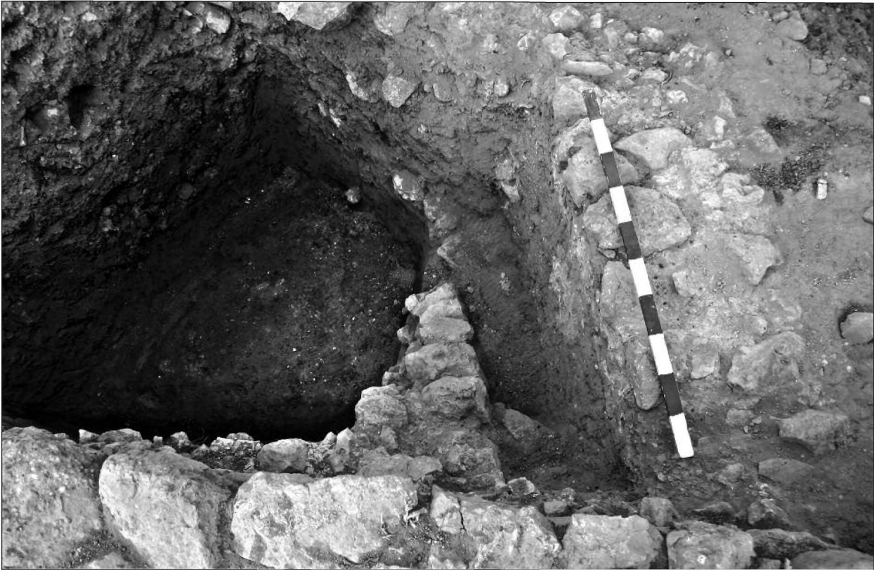
Fig. 5. Sewage canal in the street to the west of the barracks (view from the east). Canal comes out from under the western wall of the building and is cut with a Modern period pit. Cf. Fig. 1:4.

Ryc. 5. Kanał ściekowy na ulicy na zachód od koszar (widok od wschodu). Kanał wyprowadzony jest spod zachodniej ściany budynku i przecięty nowożytną jamą. Por. Ryc. 1:4.