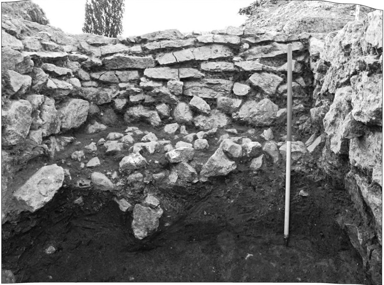
Fig. 6. One of the western rooms of the barracks in the course of excavations (view from the south). Remains of the pavement which adjoins the eastern wall can be seen in the room (Photo A. Trzop-Szczypiorska).

Рис. 6. Jedno z zachodnich pomieszczeń koszar podczas badań, widok od południa. W pomieszczeniu widoczne pozostałości bruku, który styka się ze ścianą wschodnią pomieszczenia.