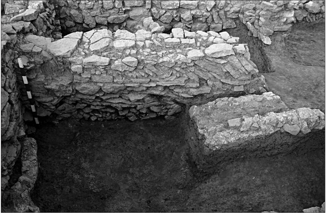
Fig. 3. Examinations in the interior of the barracks (view from the east). Fragment of the canal (water conduit?) and the reservoir situated below the foundations of the barracks. Cf. Fig. 1:6,7.

Рис. 3. Баданія ўнутры казарм (від з усходу). Фрагмент канала (водопровода?) і зборніка поўжоняе фундаментў казарм. Пор. Рис. 1:6,7.