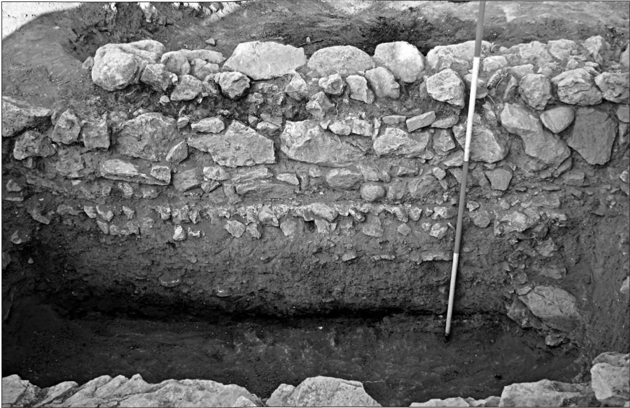
Fig. 2. Western wall of the barracks (view from the east). Foundations go on the layer of pavement of small pebbles. Layer of burning (dated to the turn of the eras) can be seen below in the section.

Ryc. 2. Zachodni mur koszar (widok od wschodu). Fundament przebiega po warstwie bruku z drobnego kamienia. Poniżej w profilu widoczna warstwa spalenizny datowana na przełom er.