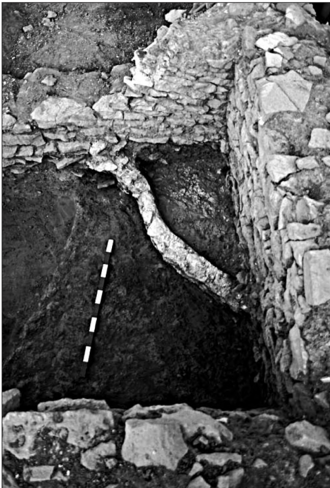
Fig. 4. Examinations in the interior of the barracks (view from the east). Fragment of the reservoir situated below the foundations of the barracks. Cf. Fig. 1:6.

Рис. 3. Исследования внутри казарм (вид с востока). Фрагмент канала (водопровода?) и сборника, расположенного ниже фундамента казарм. Ср. Рис. 1:6,7.