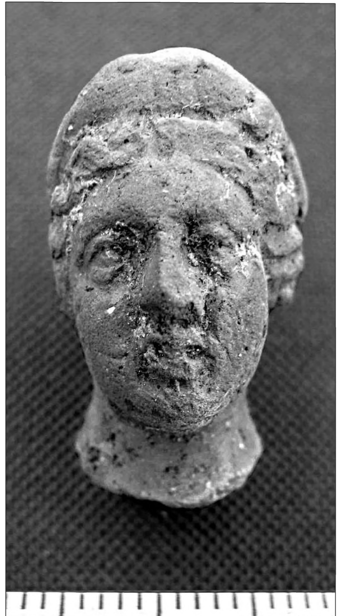
Fig. 7. Woman's head made of terracotta. One of the finds coming from the Modern period pits.

Ryc. 7. Głównka kobieca wykonana z terakoty. Jedno ze znalezisk pochodzących z nowożytnych jam.