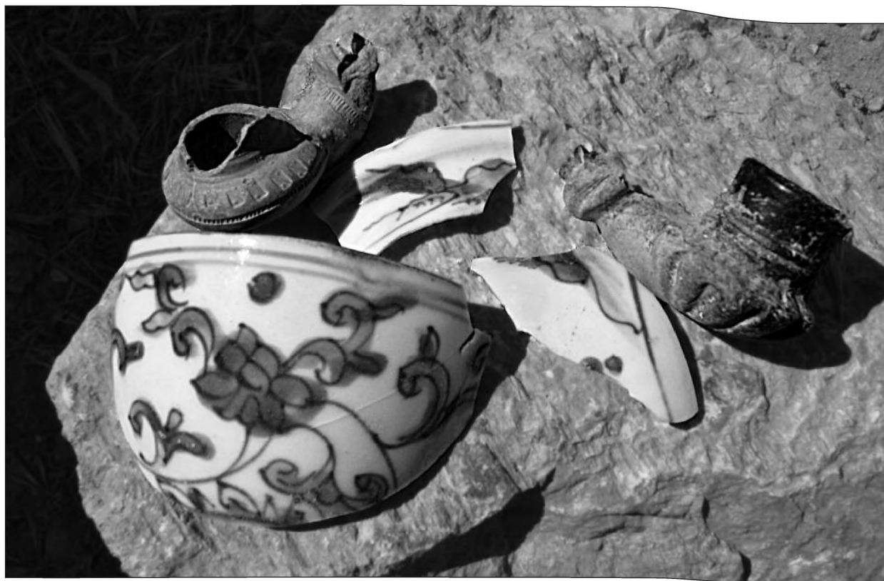
Fig. 9. Fragments of porcelain bowls and pipes extracted from one of the pits.