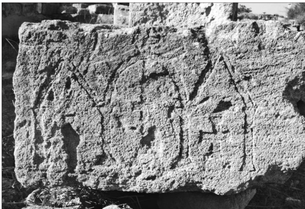
Fig. 1. The block of limestone from House T in Ptolemais.

within the area of this famous antique city in Cyrenaica. This cuboidal block still lies in the ruins of a Roman dwelling house in Ptolemais, in the so-called House of the Triapsidal Hall, or House T (Fig. 2). 1 Meanwhile, the large and luxurious House T with a central peristyle covers