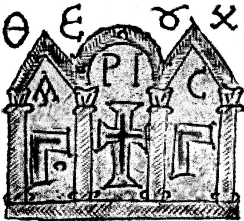
Fig. 6. Drawing incised on a three ounce weight, copper alloy, 5 th –6 th c., British Museum, London (CH. ENTWISTLE, Byzantine Weights... , fig. 7).

Ryc. 6. Rysunek wyryty na odważniku trzech uncji, stop miedzi, V–VI w., British Museum, Londyn.