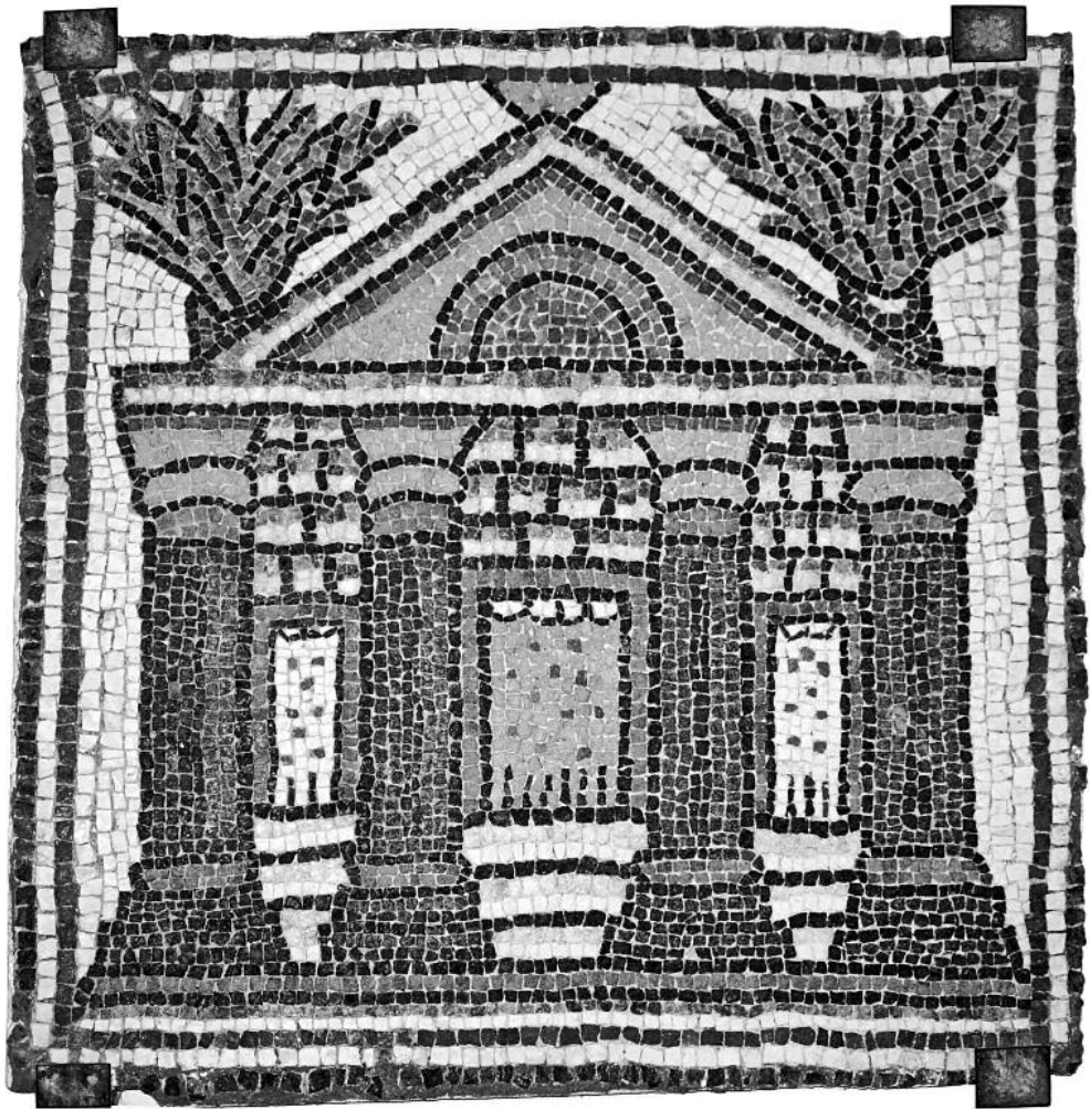
Ryc. 5. Mozaika z Bazyliki Wschodniej w Qasr el-Libia, VI w.

of nature, to the achievements of the Roman civilisation, and even to everyday life. All these motifs reflect the heritage of the Antiquity and the “triphorium” itself is derived mostly from a similar architectural setting, topped with a so-called Syrian arch and surrounding imperial images, which were quite popular in this form in the Late Antiquity. 15