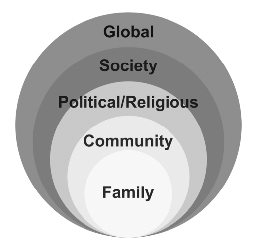
Illustration 1. Social Systems Model. Ilustracja 1. Model Systemów Społecznych.

resents a simplified nested systems model. Bronfenbrenner was interested in how individual behaviour and development is influenced by broader social contexts. Thus, he introduced a conceptual model of how the individual develops within a nested system of the micro, meso and more macro environments with hopes of expanding researchers' thinking and research activity focusing on these various contexts. Hence this model has become widely adapted as a conceptual model in sociological, psychological, health and community studies.