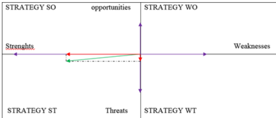
Fig. 2. Vector evaluation of SWOT analysis of a model of MAF on the example of Swiss army

Steinberg in his book writes that in Switzerland the army penetrates the society so deep that it could become dangerous. There is a problem arising from this practice. All people who served in the army have their own ideas of how it should function and what is most important for its development [Steinberg, 1996].