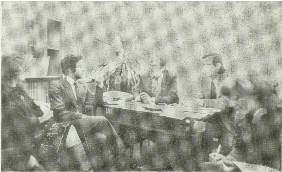
Fig. 3. Meeting of the authorities of the Faculty of Economics with professor Marco Onado, an example of cooperation with foreign countries (1979)