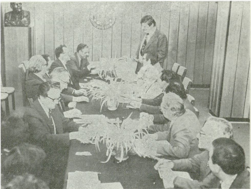
Fig. 4. Conference of the Council of the Faculty of Economics (1979)