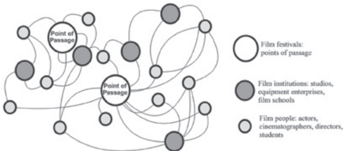
Fig. 1. The role of film festivals in the film industry network