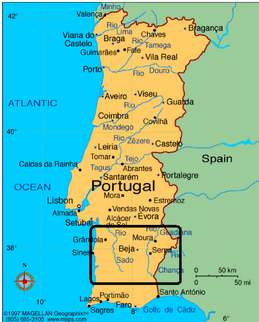
Figure 2. The territory under the direct influence of the IPBeja

The Polytechnic Institute of Beja (IPBeja) is located in Beja, the capital of Baixo Alentejo region and has as direct influence in the geographical areas called Baixo Alentejo and Alentejo Litoral. The IPBeja is the only public HEI in the region.