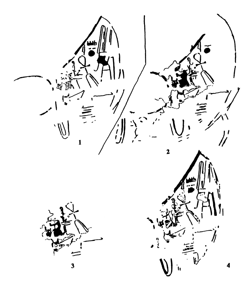
Fig. 2. Bark room of the Amun sanctuary, southern wall: successive stages of the decoration of the Amun bark. The kneeling king offering mat to a seated Amun-Re is clear on the last study. Drawing K. Spence.