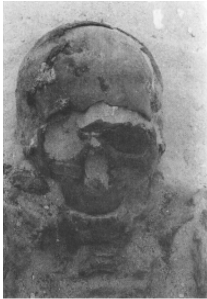
Fig. 2. Face of the skull of Burial 14 showing the swab in the left eye socket and linen preserved on the skull.

In the opinion of L. Bareš it might have been a case of cutting up the body and its fixation with the aid of sticks for fear of return. Such a practice he calls "vampirism". 8