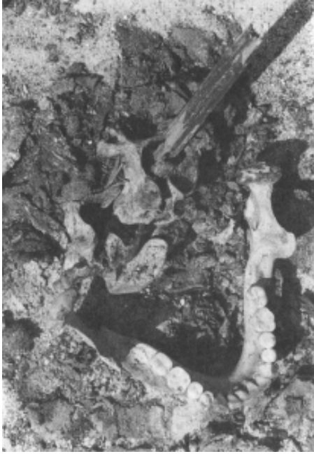
Fig. 3. Wooden stick placed inside the hole (foramen magnum) at the bottom of the skull. Phot. R. Meszka.

the death of the two persons. It is not clear, however, whether the cutting up of the bodies of the two men occurred after their death.