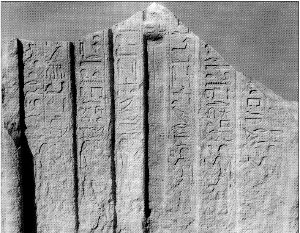
Fig. 1. Stele of Meref-nebef

[...] - p c t ḥ3ty- c smr w c ty Mr.f-nb.f